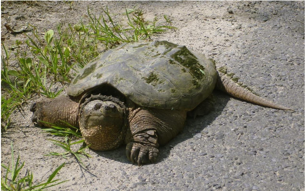
Figure 1. The Common Snapping Turtle, one of the most widespread reptiles in North America. Photo taken in Quebec, Canada.