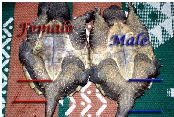
Figure 4. Difference in pre-cloacal tail length in female and male Chelydra rossignonii , a Central American snapping turtle that was previously considered a subspecies of C. serpentina .

growth and muddy sediment accumulation. The plastron, usually yellowed, is drastically reduced, to such an extent that the turtle cannot withdraw completely into its shell. The skin of C. serpentina is also highly variable in coloration, typically darker on its dorsally exposed surfaces and lighter on ventrally exposed surfaces. The texture is irregular, containing a mix of densely organized scales (near the head, tail, and feet) and thick wrinkled folds. The turtle's head is large, terminating in a wide beaked mouth, and can be withdrawn into the carapace. The toothless mouth's interior coloration is pale pink. The eyes are dorsally directed, and exhibit a crossed yellow and black pattern. Supporting the head is an elongated neck, which can be rapidly extended up to half of the turtle's carapace length. Legs are stout and heavily scaled, and each webbed foot has five clawed digits. The tail can be as long as the individual's carapace, and is characterized by three rows of dermal ridges. The middle ridge can be dramatically raised, resulting in a distinctly saurian appearance. Juveniles resemble miniature adults, but possess a rougher carapace texture that gradually smoothens later in life. Sexual dimorphism in C. serpentina is most accurately demonstrated by the difference in pre-cloacal tail length; in males, the distance from the posterior end of the plastron to the cloaca is greater. Males also generally have longer and thicker tails than females.