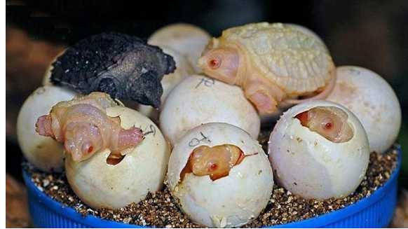
Figure 8. Hatchling “normal” and “albino” C. serpentina for sale.