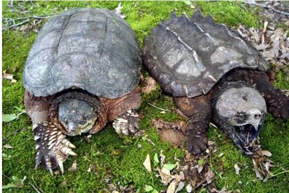
Figure 5. Chelydra serpentina (left) and Macrochelys temminckii (right). Photo from http://www.chelydra.org/common_alligator_snapping_turtle.html . (This site provides additional visualizations of the differences between these two North American snapping turtle species).

to endure the harsh winter conditions present in eastern Canadian provinces and the northern United States.