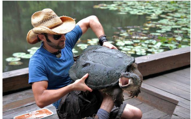
Figure 9. A 45 lb. common snapping turtle caught in the Blacklick Woods in Central Ohio. Removal projects that target sexually mature individuals such as this one represent the most cost-effective management strategy for dealing with C. serpentina invasions.