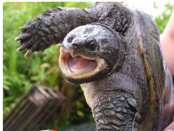
Figure 3. Front-view of a captured Chelydra serpentina . Different skin textures and the distinctive pink mouth are visible from this angle.

Chelydra serpentina (the common snapping turtle) is a large, robust aquatic turtle. Mature individuals can have a carapace length of up to 19 inches, and can achieve a maximum weight of 86 lbs. (USGS Database). The carapace is composed of three flattened rows of plates, smooth on the anterior end and serrated at the posterior end (Chelydra.org). Coloration of the carapace is variable and indicative of the turtle's environmental conditions, ranging from a matte charcoal black to a polished, tanned brown. Often shells are mottled and discolored by algal