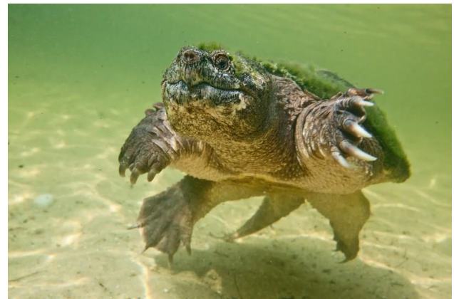
Figure 6. An adept swimmer with webbed feet, C. serpentina is equally suited for ambush predation on unwary waterfowl at the surface as foraging in benthic muck for aquatic invertebrates. Terrestrial foraging has also been documented.

C. serpentina is an opportunistic omnivore, maintaining a generalist diet that consists of region-specific types and amounts of macrophytes, crayfish, snails, leeches, fishes, amphibians, turtles, snakes, small mammals, and birds ( www.willametteturtles.com , USGS database). In the Pacific Northwest, C.