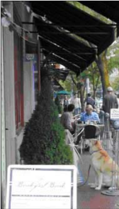
Seattle Cafe www.seattle.gov

"Sidewalk Cafes are an enjoyable addition to Seattle's vibrant collection of restaurants." -Seattle.gov