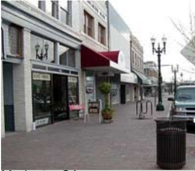
Modesto, CA www.visitmodesto.com

"Pedestrian activity makes residential areas more neighborly and commercial areas more vibrant." - www.walkboston.org