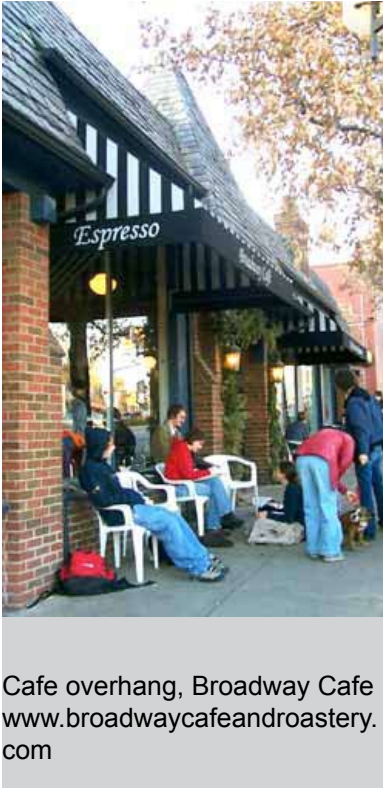
Cafe overhang, Broadway Cafe www.broadwaycafeandroastery.com

"Streets and their sidewalks, the public places of a city, are its most vital organs." -Jane Jacobs