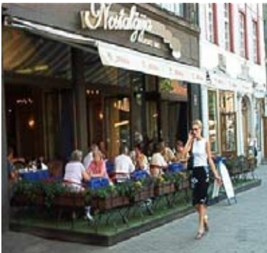
Cafe separation device.