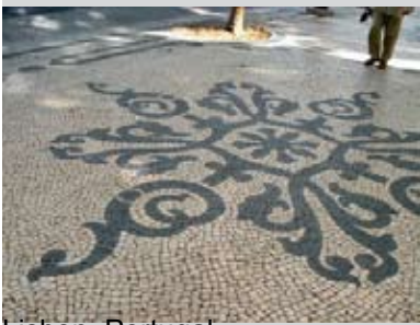
Lisbon, Portugal www.vagabondboots.com