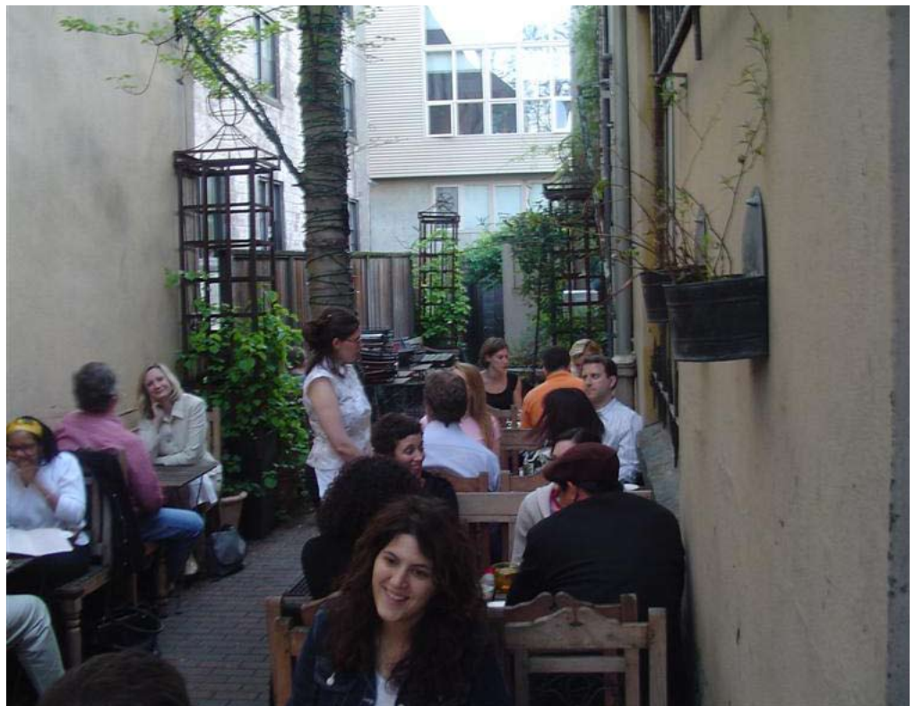
Seattle Outdoor Cafe www.urbanplanet.org

Outdoor cafes are excellent ways to improve and liven a street. They not only encourage bring flare to a city, but also enhance the economy. The implementation of cafes should be encouraged by cities, especially Seattle. Most cities provide free advice and information to help businesses through the application process. It is important remember that although there are many benefits for outdoor cafes, there are also challenges including the appearance of sidewalks as cluttered, and reducing pedestrian flow, and they can become unattractive if the outdoor furniture is not chosen well and is not properly maintained, because of this, it is essential for cities to carefully consider the regulations that business owners must follow.