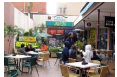
Bohemia Cafe, Sydney, Australia. http://www.accommodationsydney.com