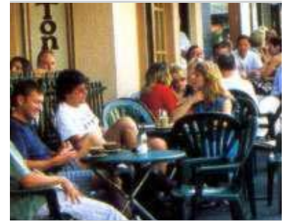
Sidewalk Cafe in Sydney www.access.nsw.edu.au

*Cafes must consist of a maximum of two chairs and two tables for each twenty-five feet of store frontage.