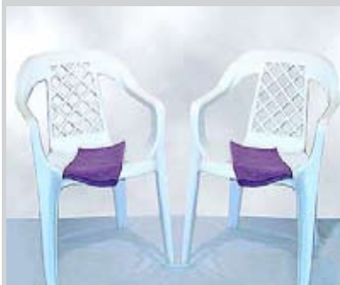
The infamous white resin chairs. www.bestrentalservice.com