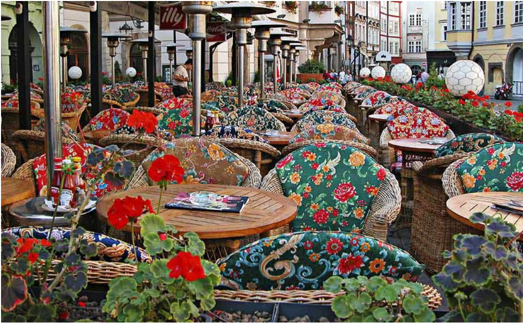
Cafe on Old Town Square, Prague