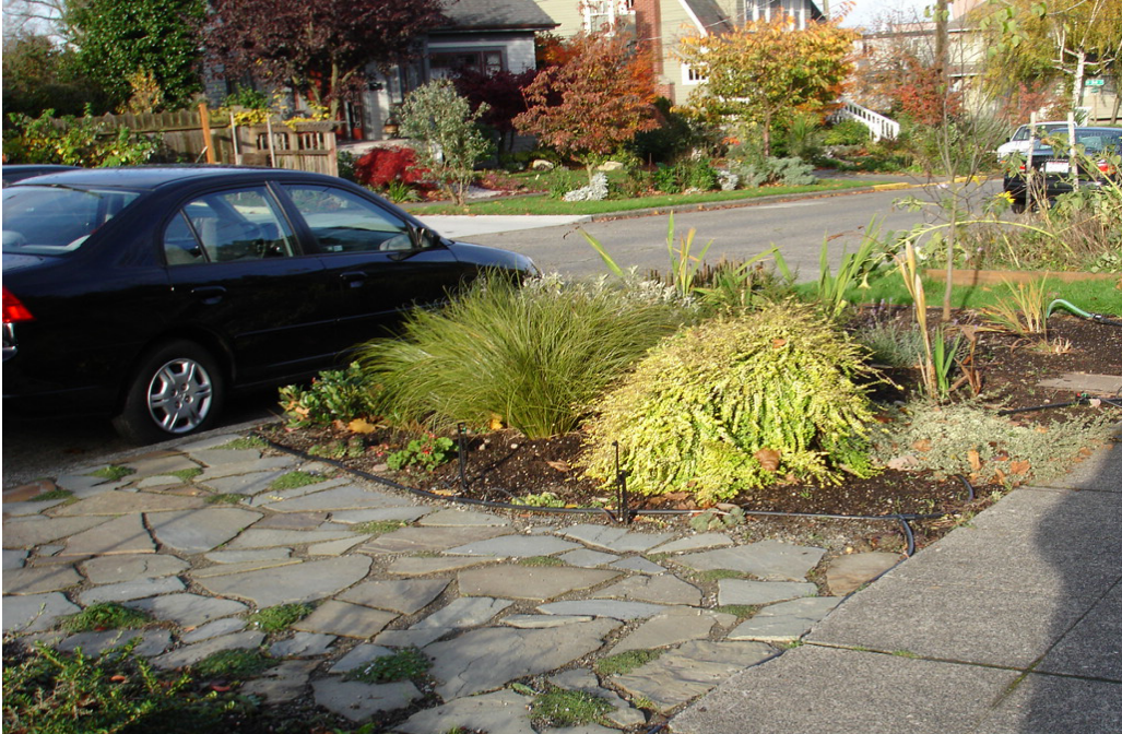
Wallingford Parking Strip JLF

G arden space is at a premium in any city. In Seattle, residents are finding ways to use parking strip medians in creative ways. These residual spaces, typically planted up with grass and street trees, are gaining popularity as spaces for ornamental and vegetable gardens. The City of Seattle encourages “beautification of planting strips,” and even publishes recommendations for maintaining safe vehicular sightlines.