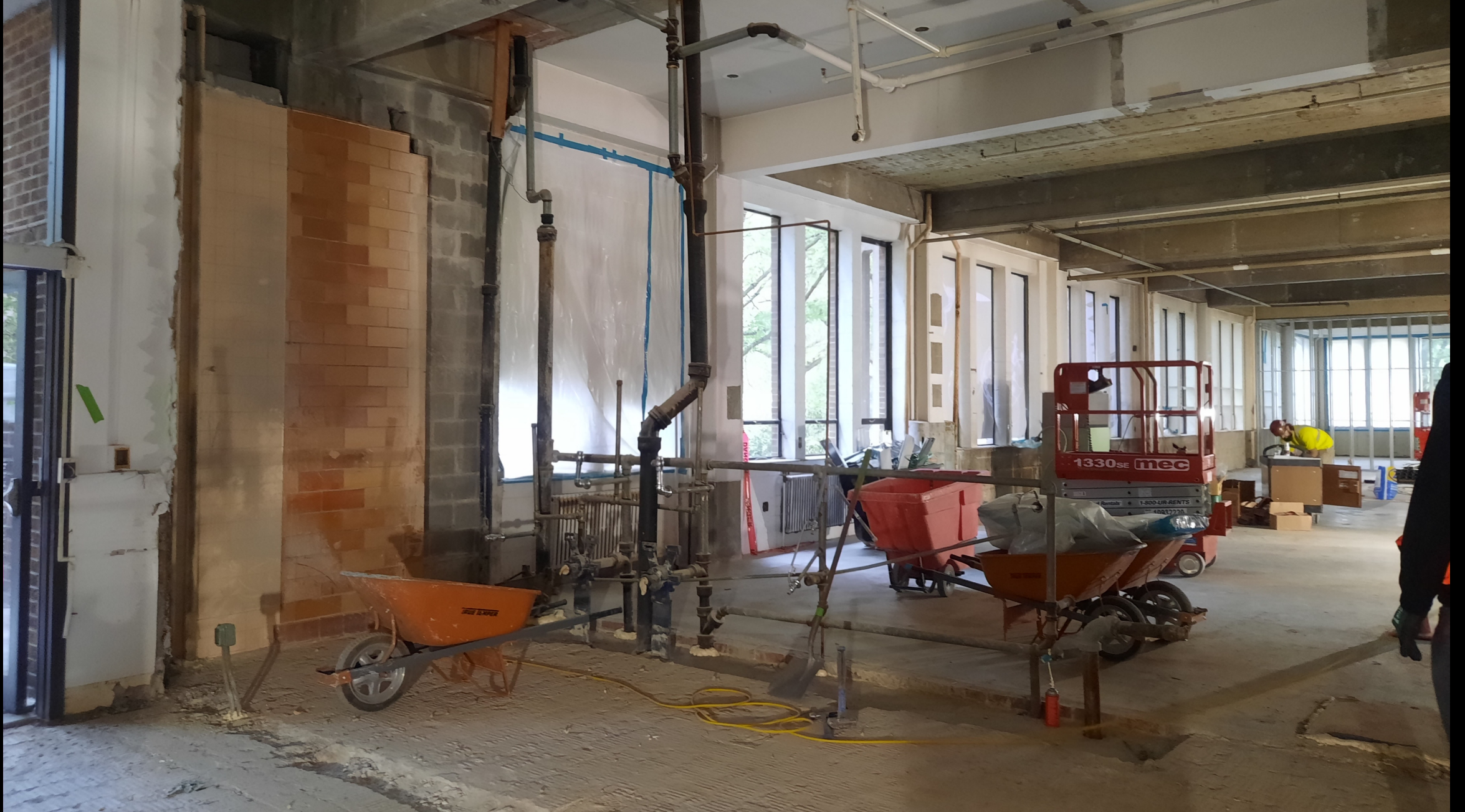
Former bathroom / classrooms / offices; will be Gathering Space and Jacob Lawrence Gallery