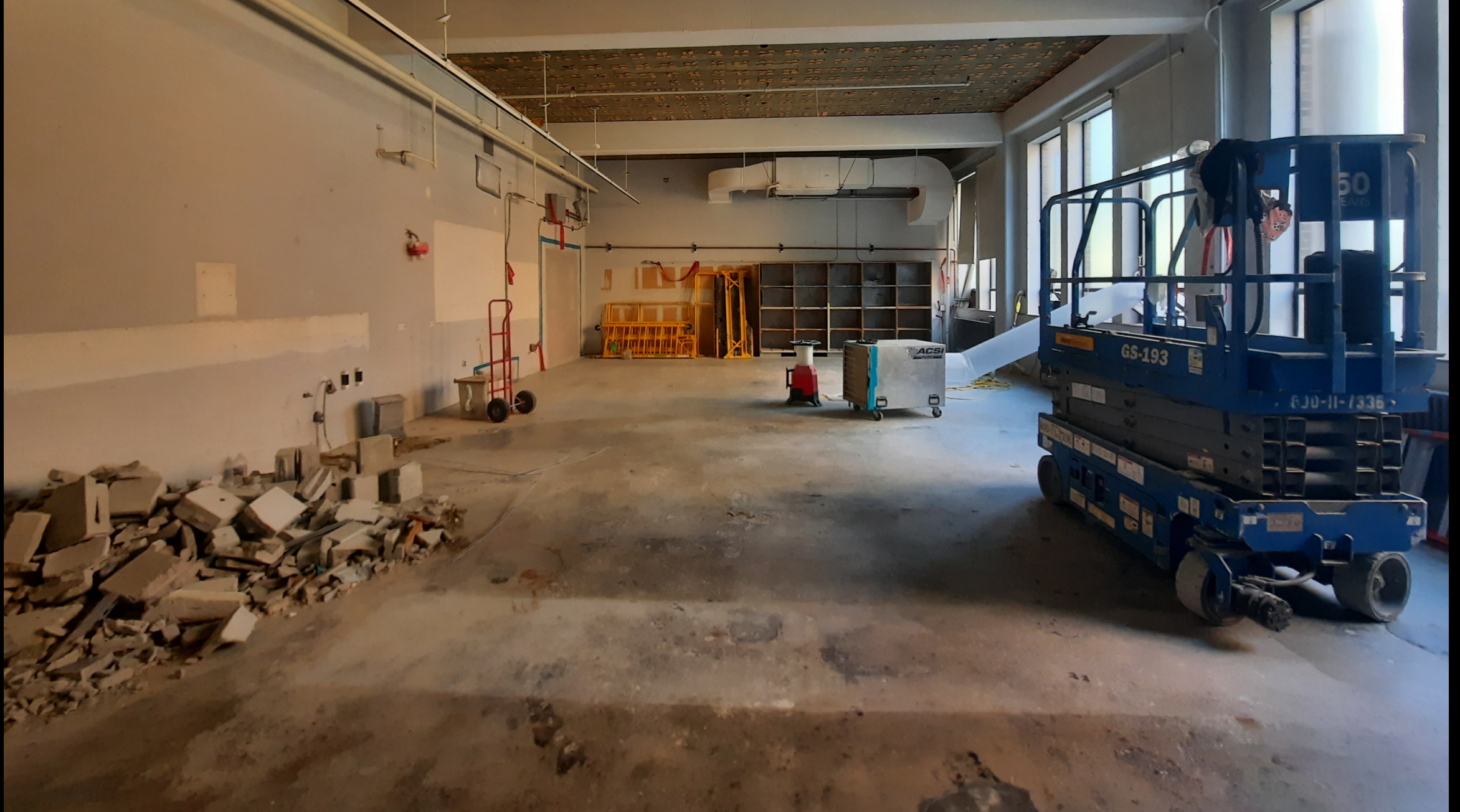
Former ceramics classroom after demolition