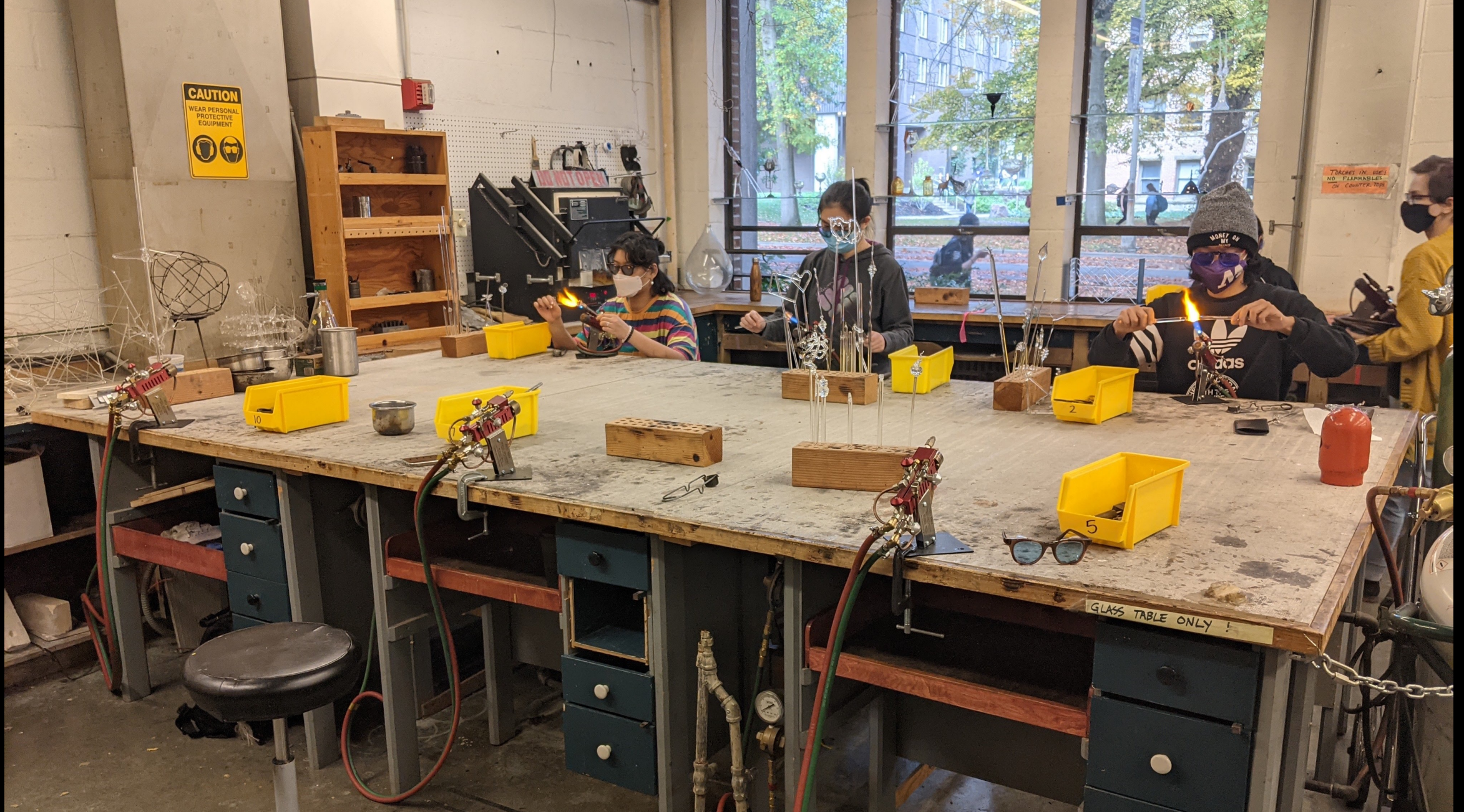
Original glass lampworking classroom