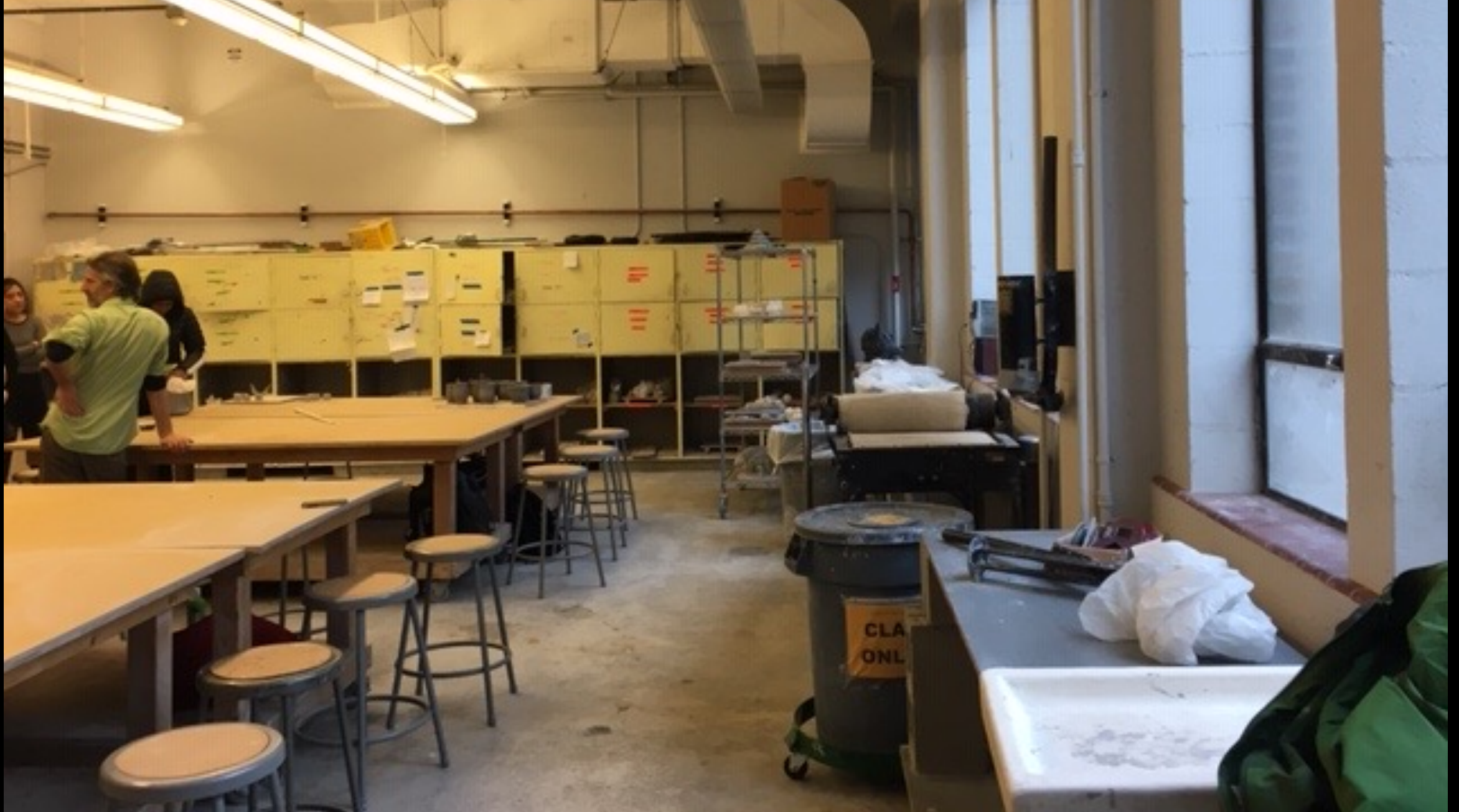
Original ceramics classroom