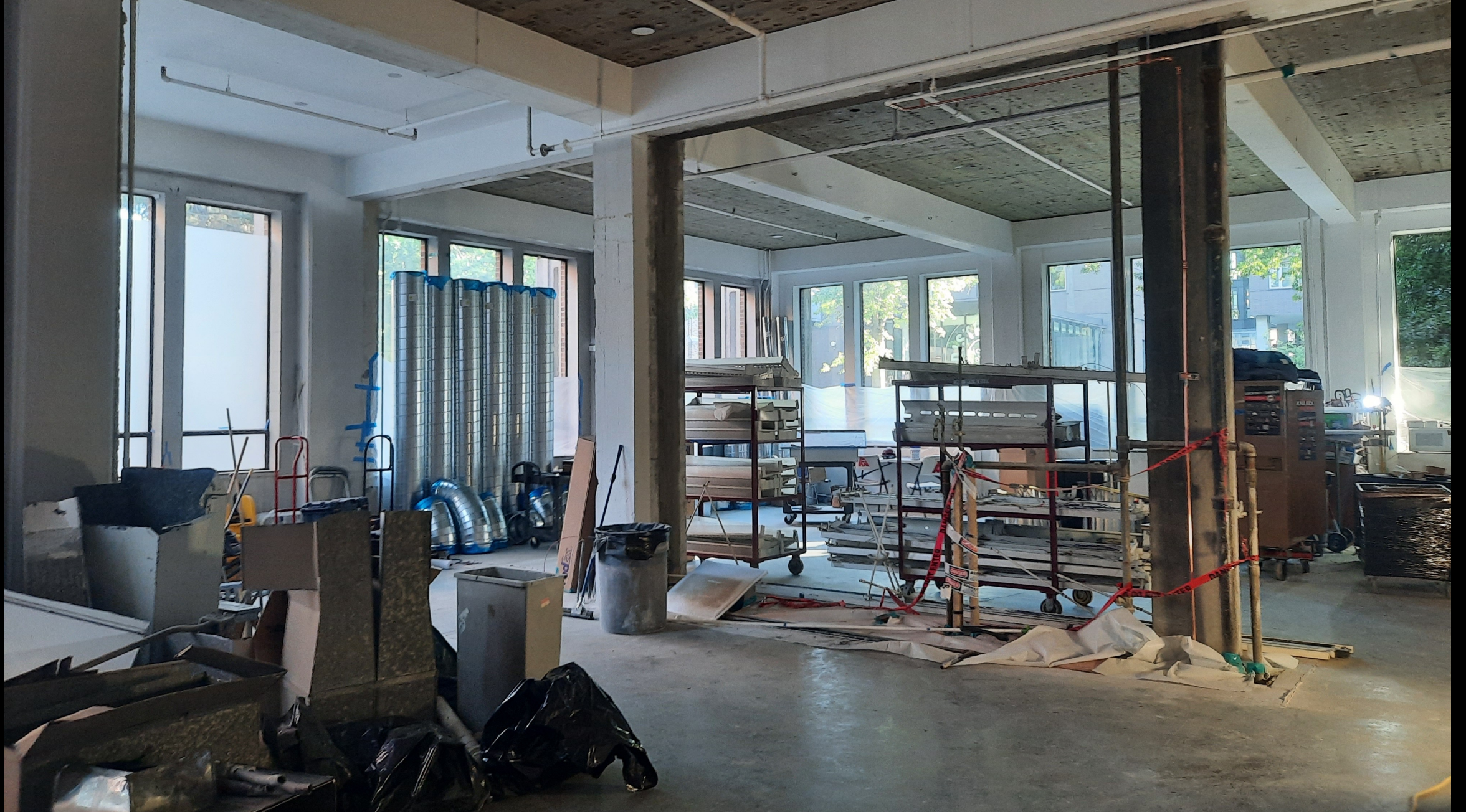
Former Jacob Lawrence Gallery space after demolition; will become ceramics classroom