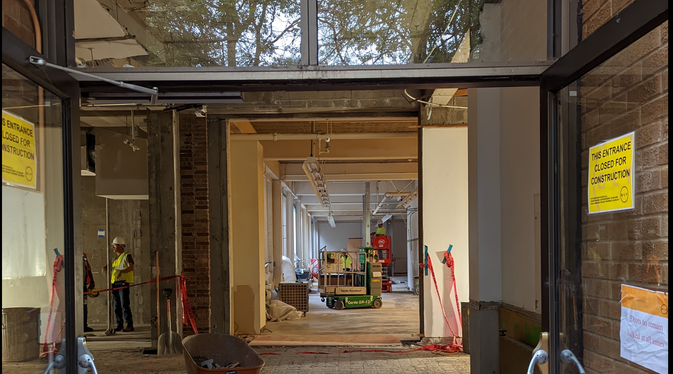
Looking from building entrance toward “window” into Advanced Concepts Lab and Woodshop