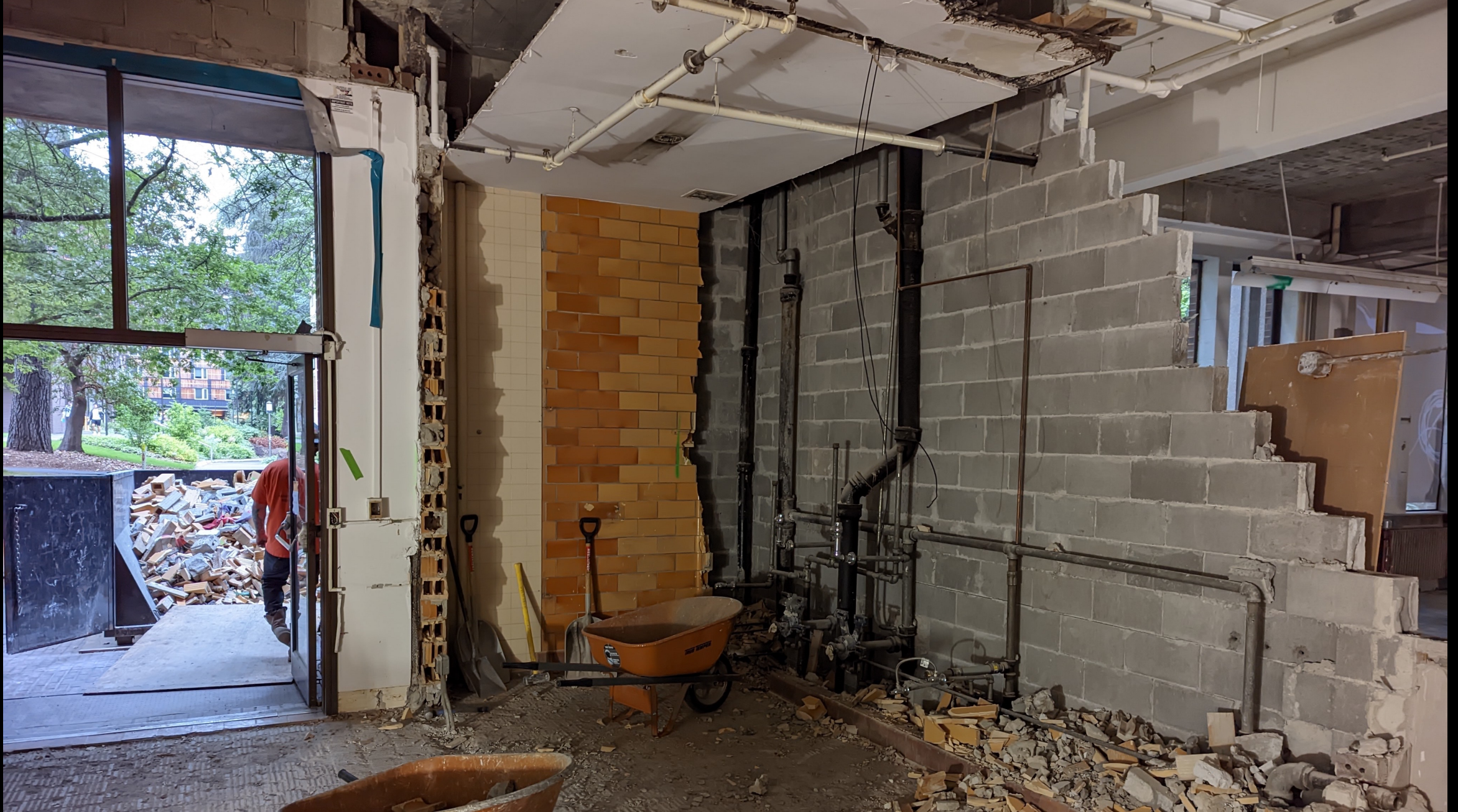
Demolition of men's restroom and wall towards sculpture classroom