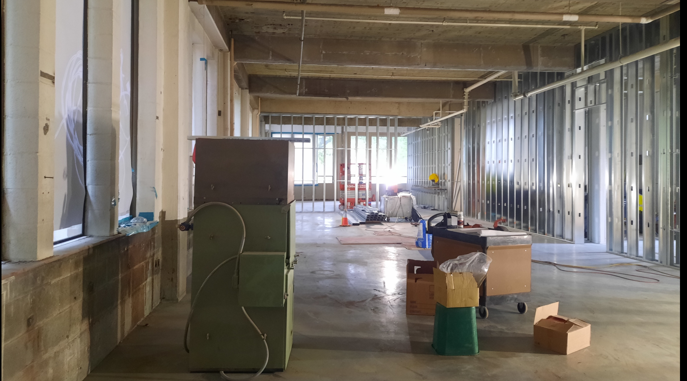
Former classrooms / offices; new framing for Jacob Lawrence Gallery and adjacent spaces