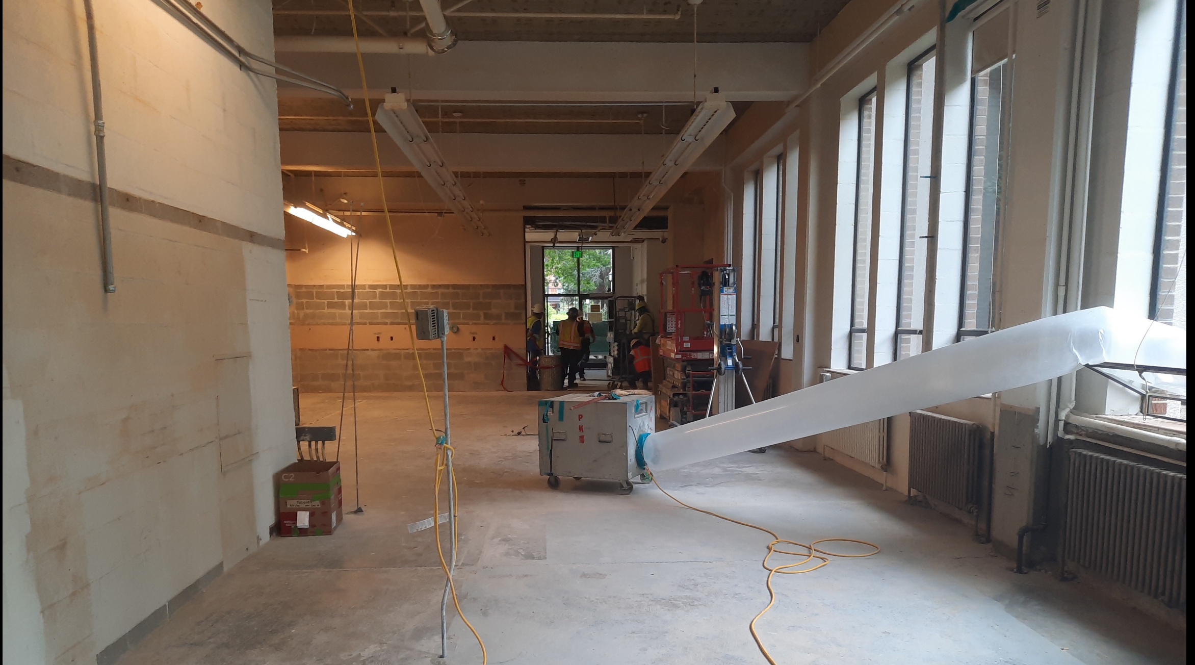
Former Woodshop space after demolition; will be Advanced Concepts Lab (note hole in wall towards building entrance)