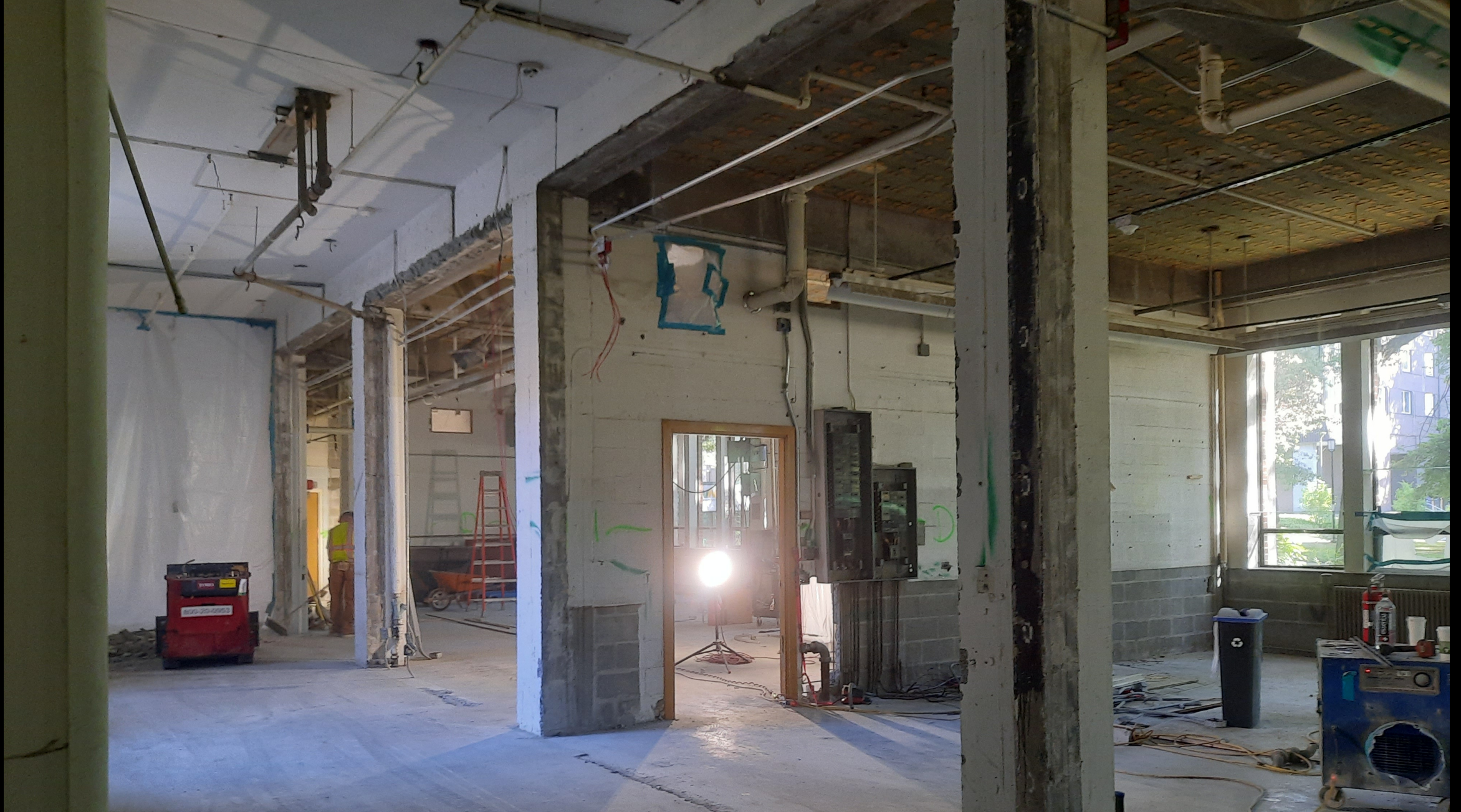
Demolition of former sculpture classroom, glass lampworking classroom, and adjacent rooms