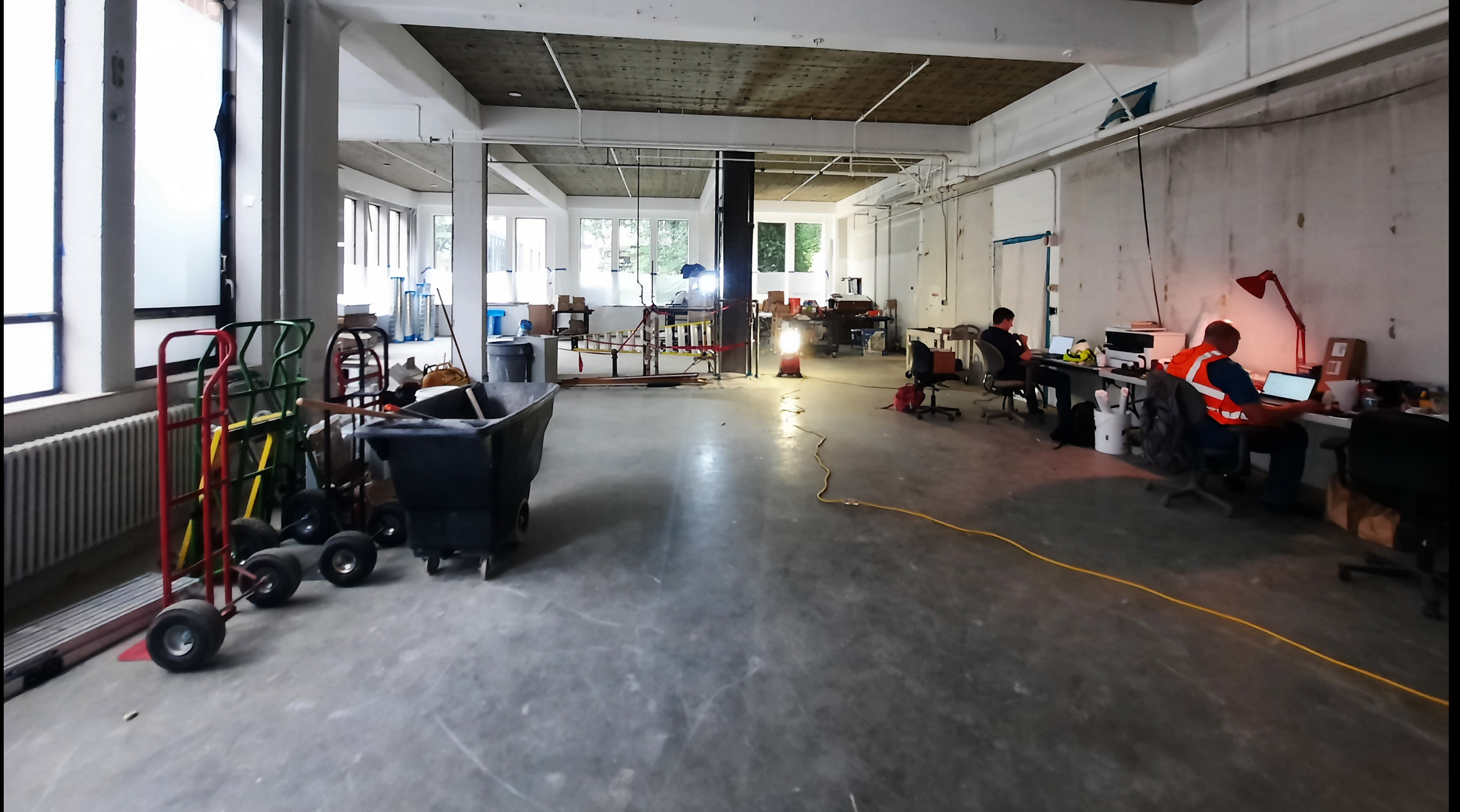
Former Jacob Lawrence Gallery space after demolition; will become ceramics classroom