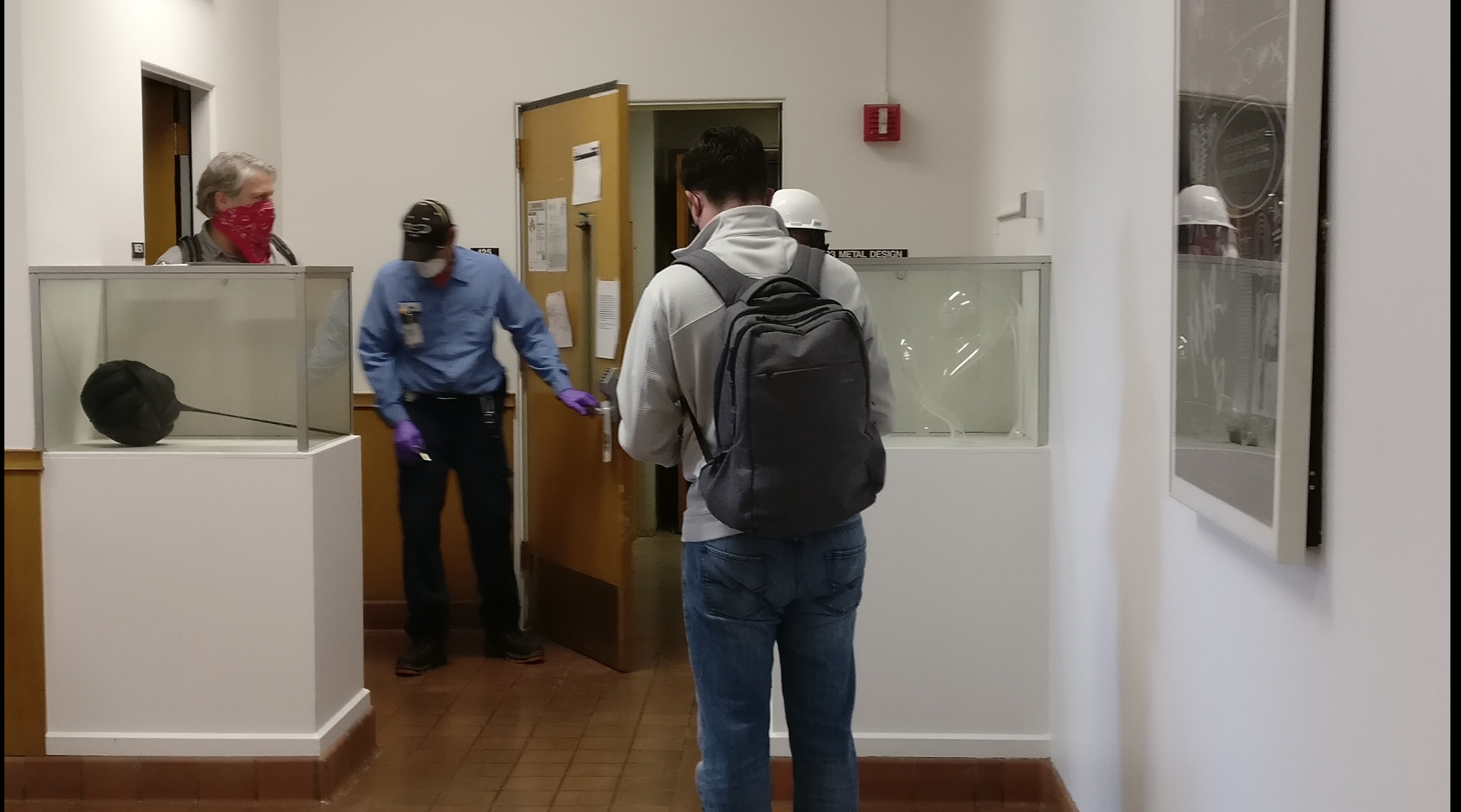
Original entrances to men's restroom and sculpture / glass classrooms