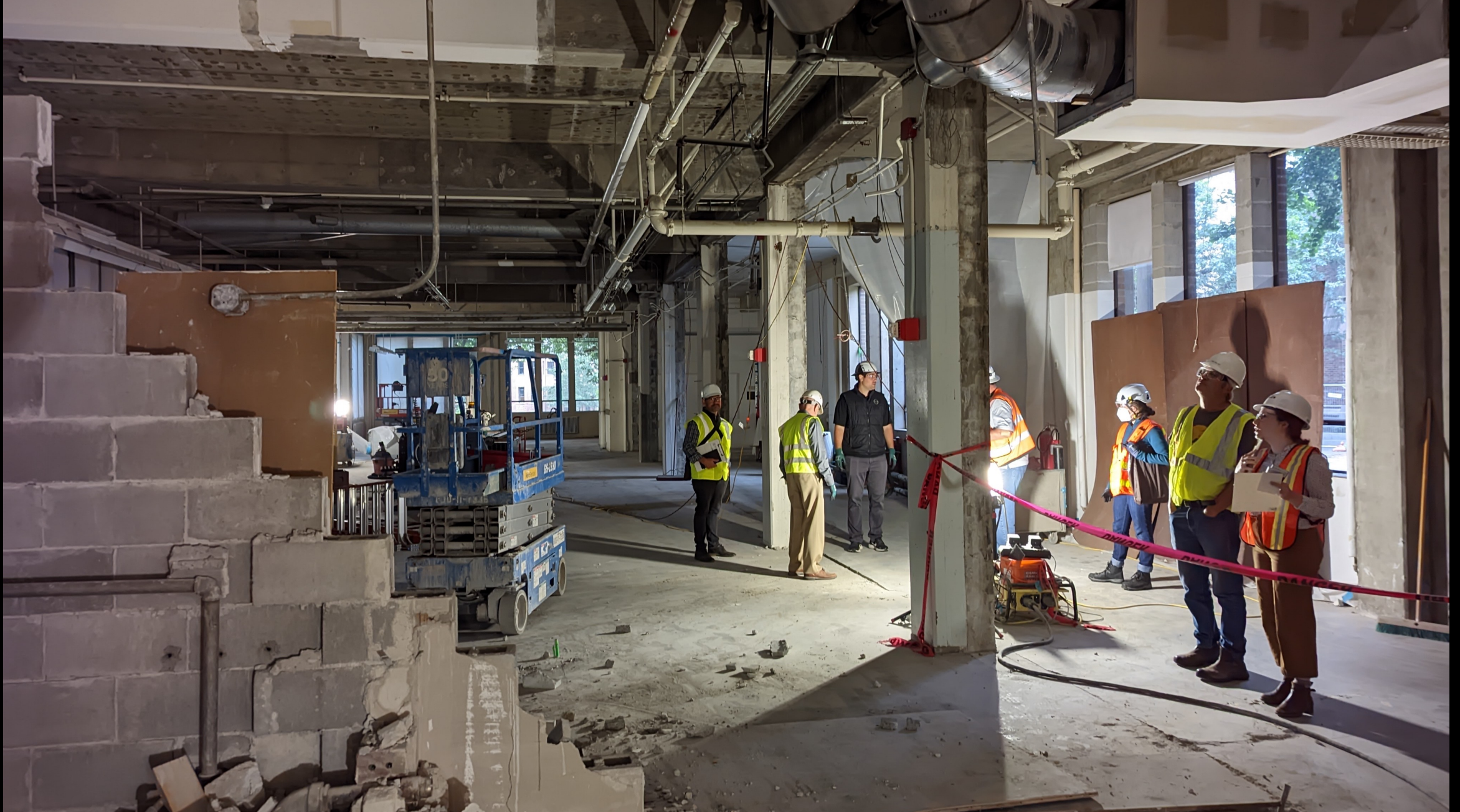
Former classrooms / offices; will be Gathering Space, Jacob Lawrence Gallery, and adjacent spaces