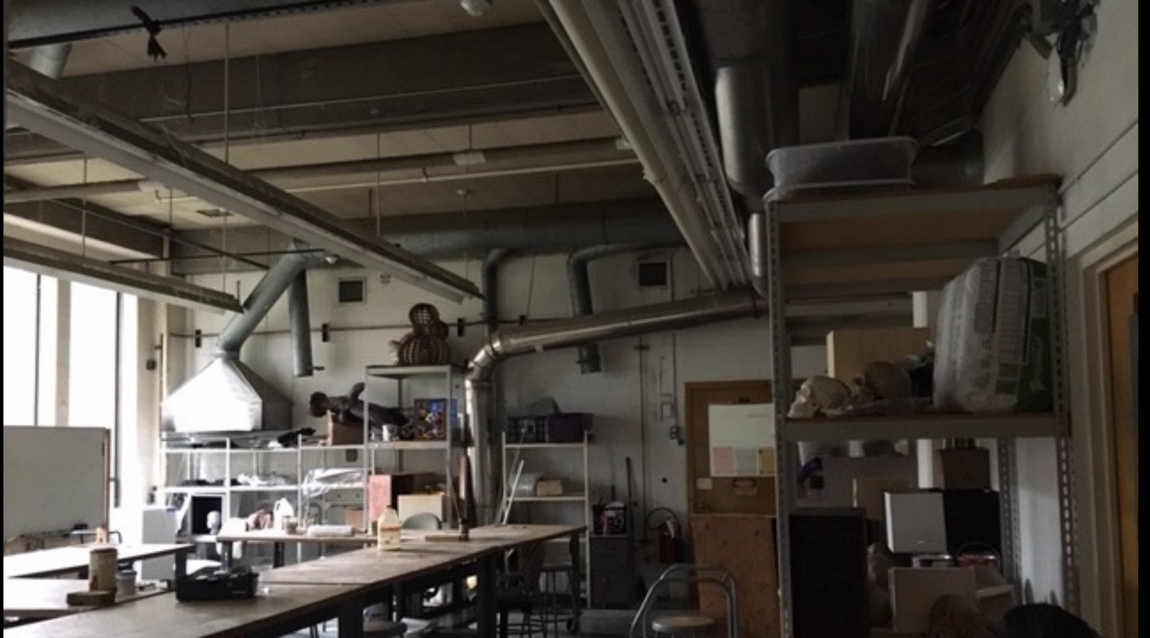
Original sculpture classroom