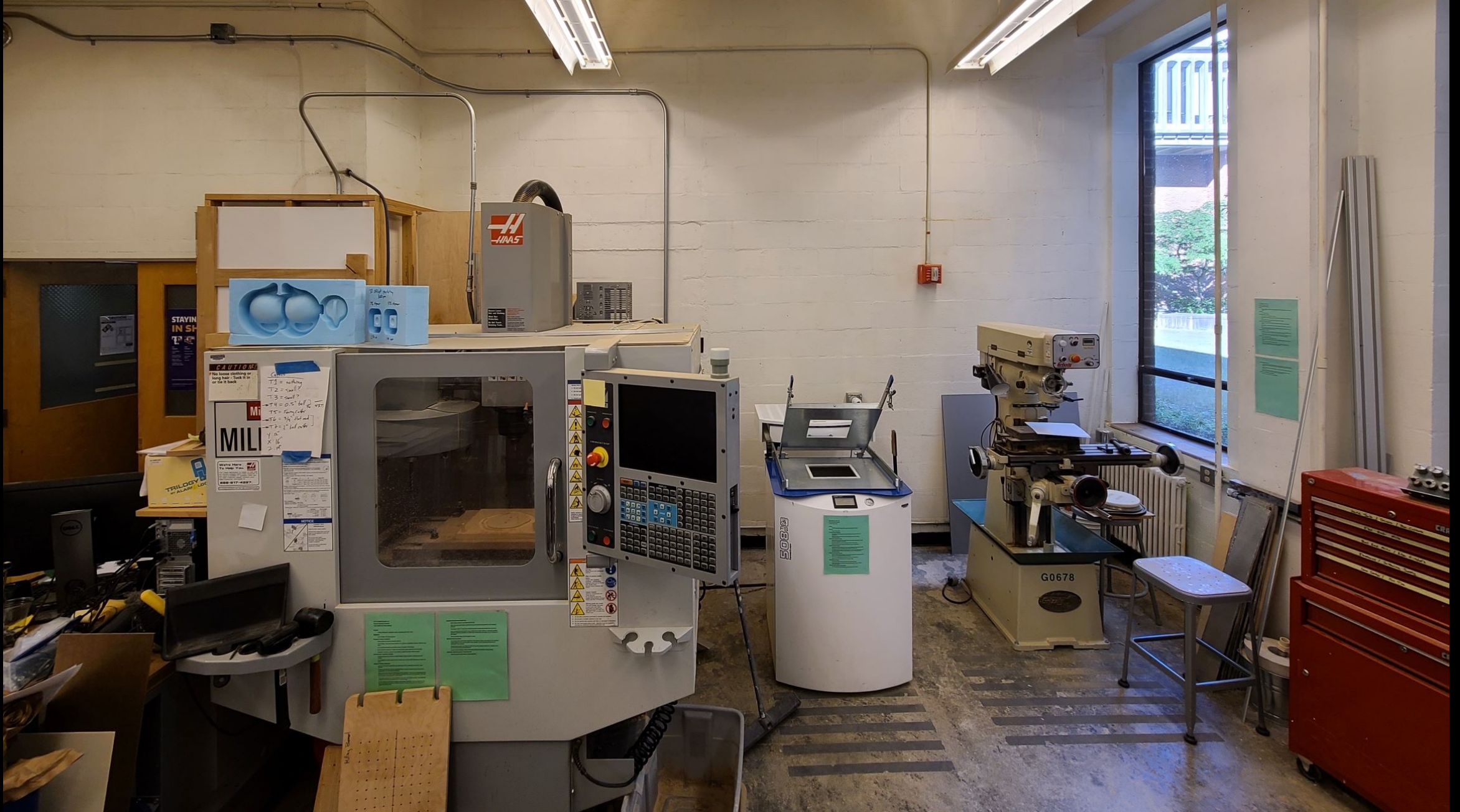
Original Advanced Concepts Lab space