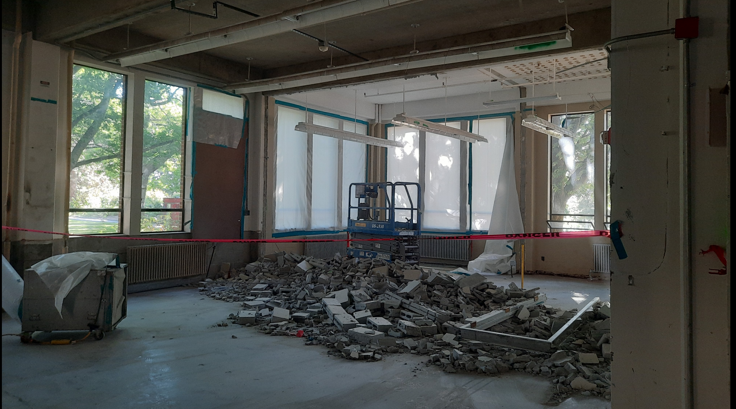
Demolition of former glass lampworking classroom and faculty offices