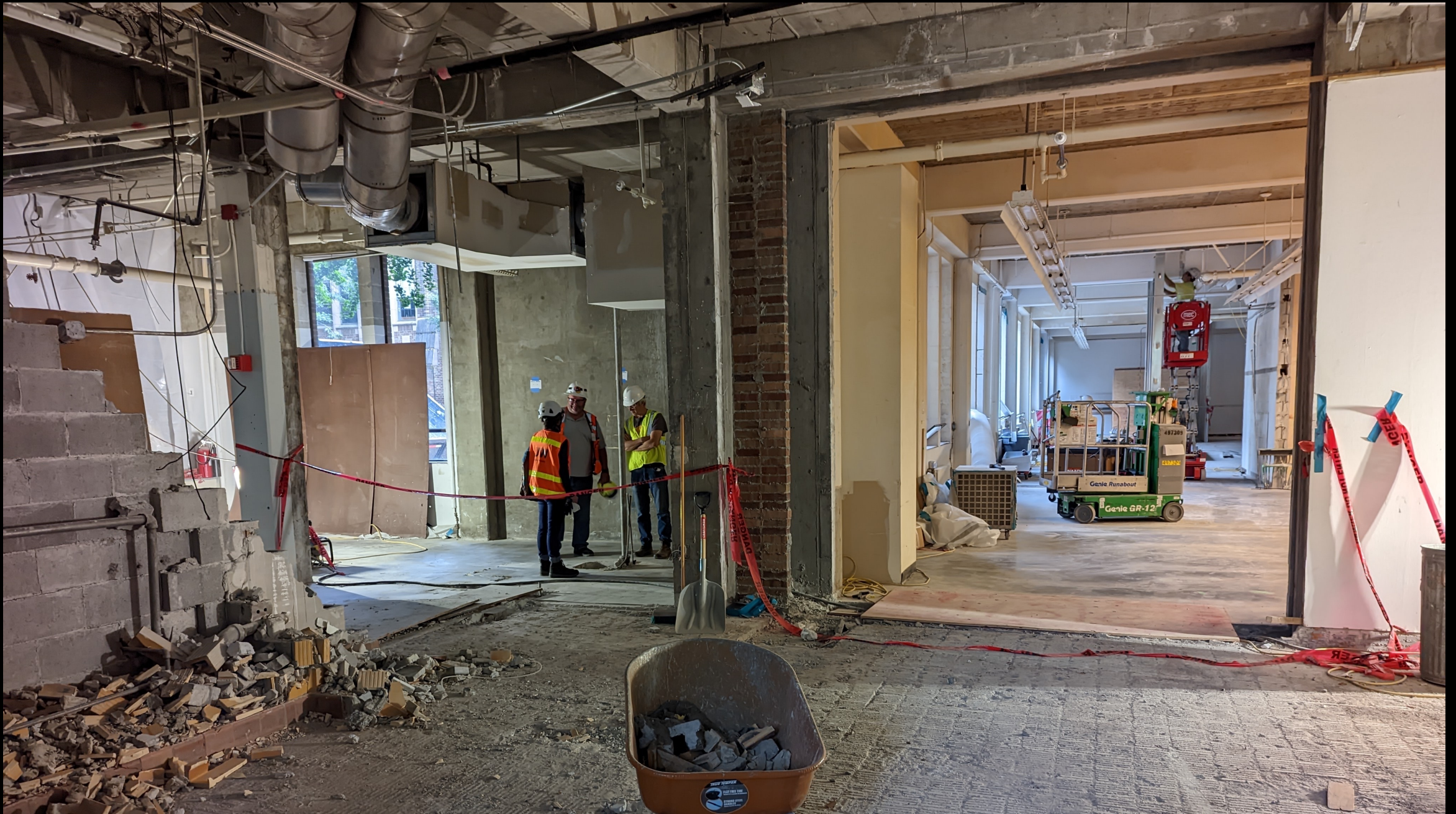
Entryway, “window” into Advanced Concepts Lab and Woodshop, and adjacent spaces towards new Jacob Lawrence Gallery