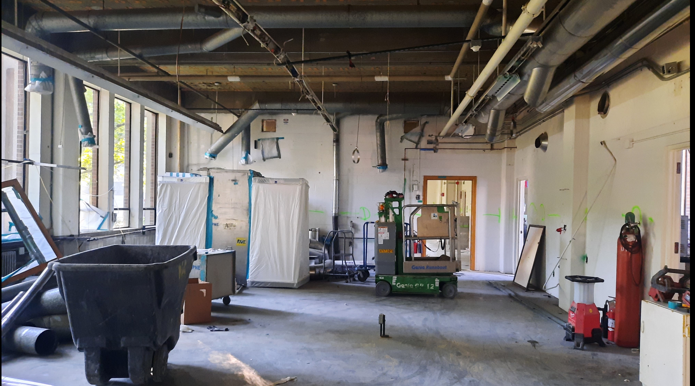
Former sculpture classroom after partial demolition