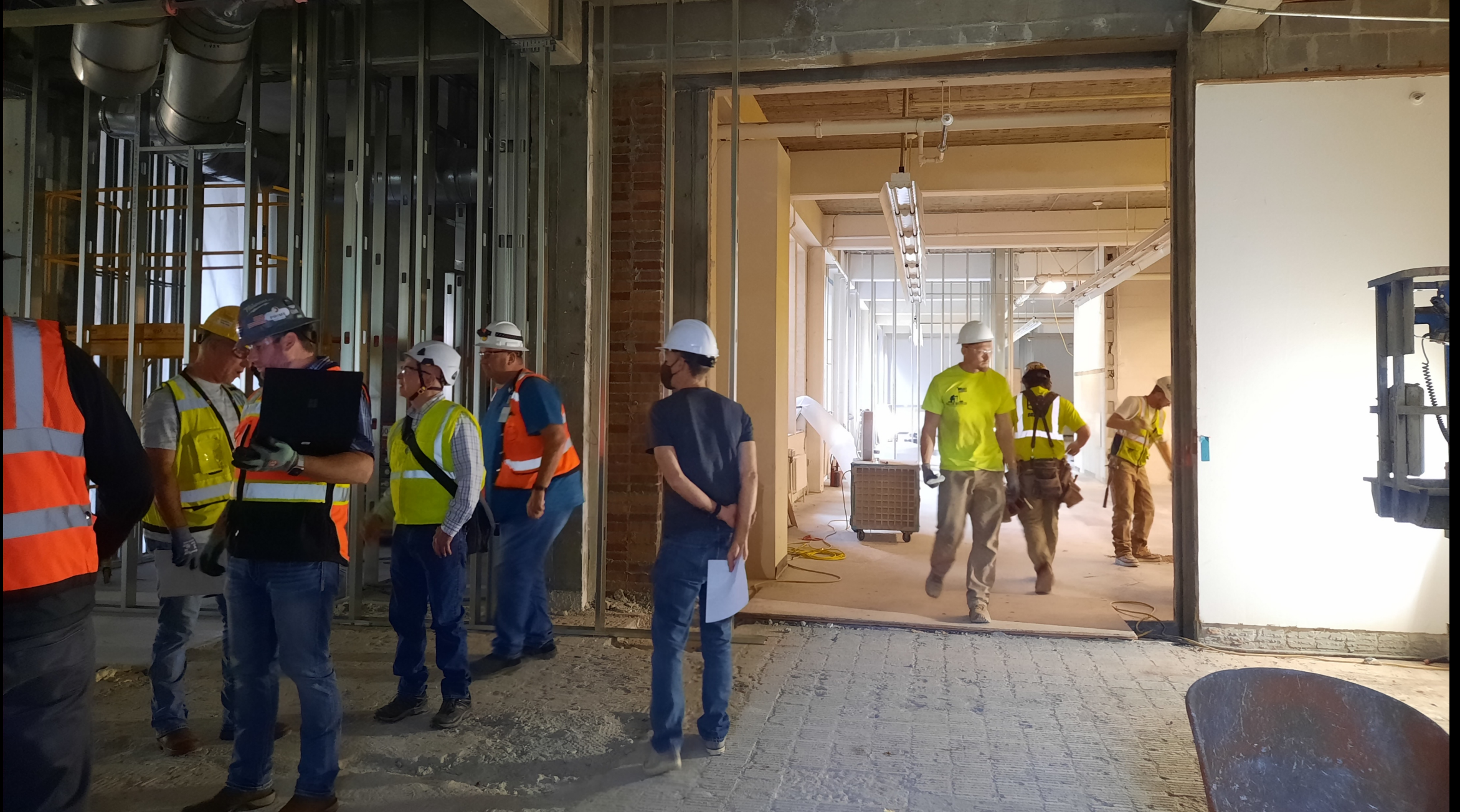
Entryway, “window” into Advanced Concepts Lab and Woodshop, and adjacent spaces with new framing