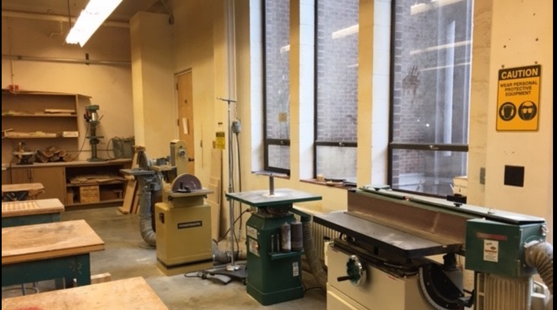
Original Woodshop space