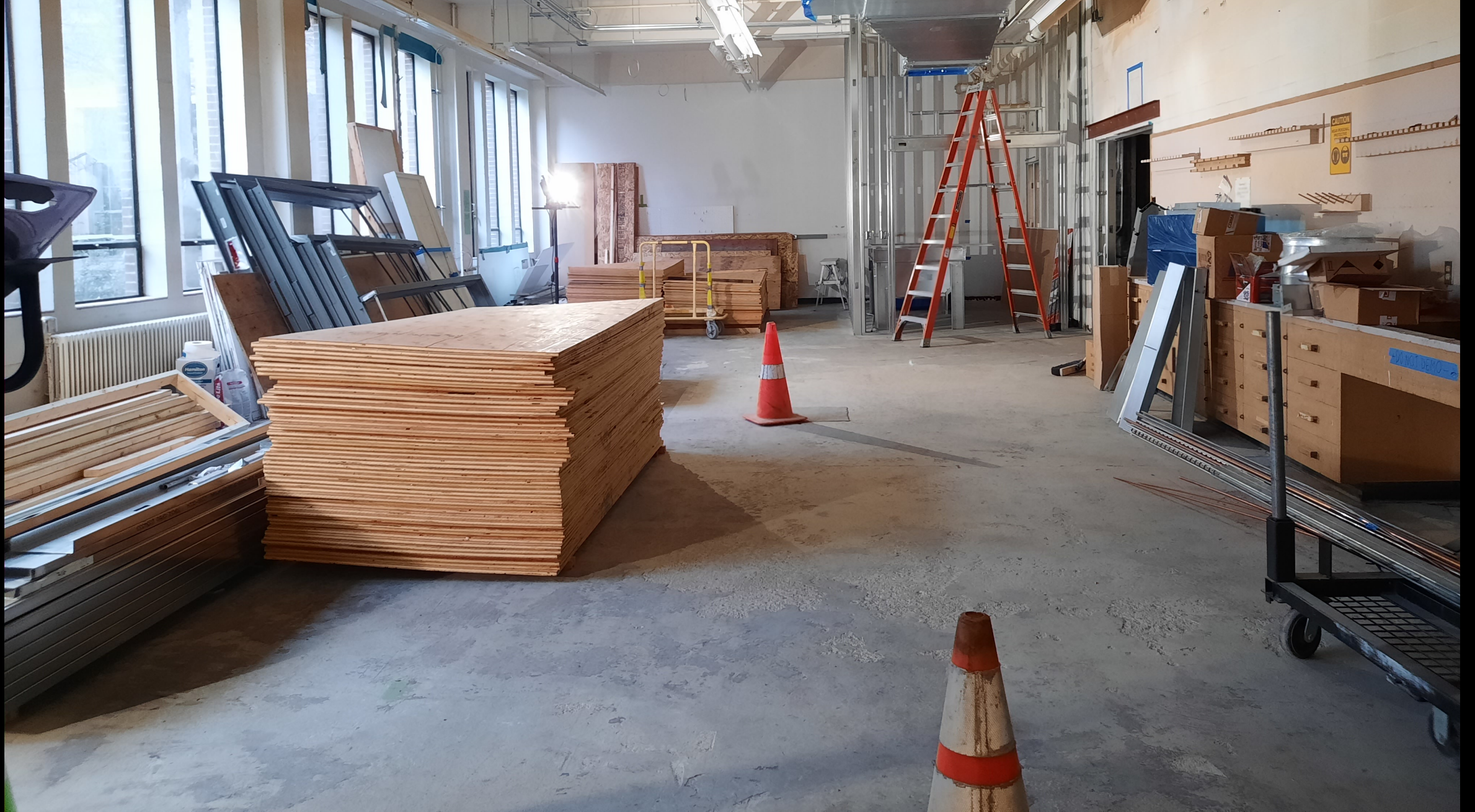
Woodshop space with dust collector framing at back