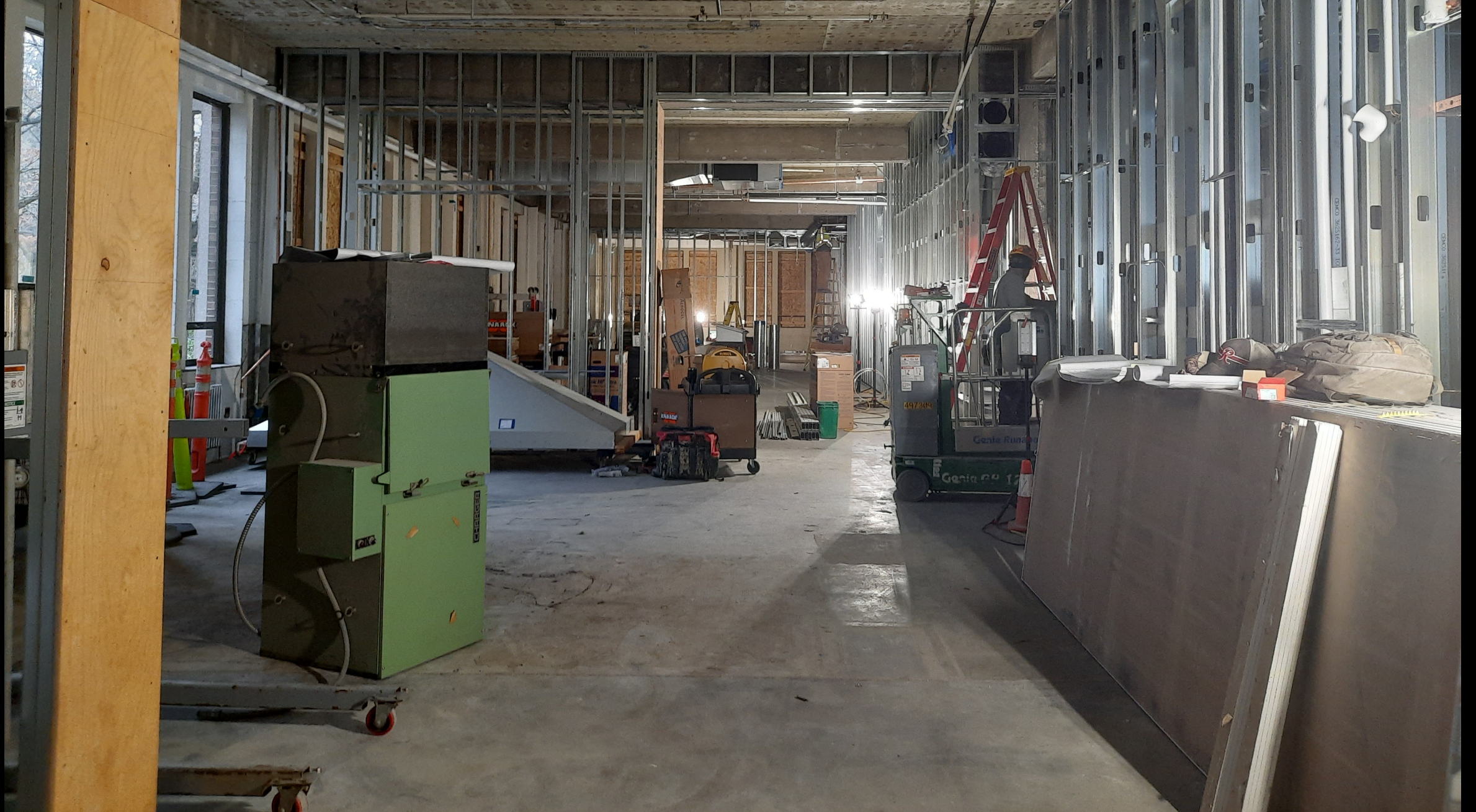
Former classrooms / offices; additional framing for Jacob Lawrence Gallery and adjacent spaces