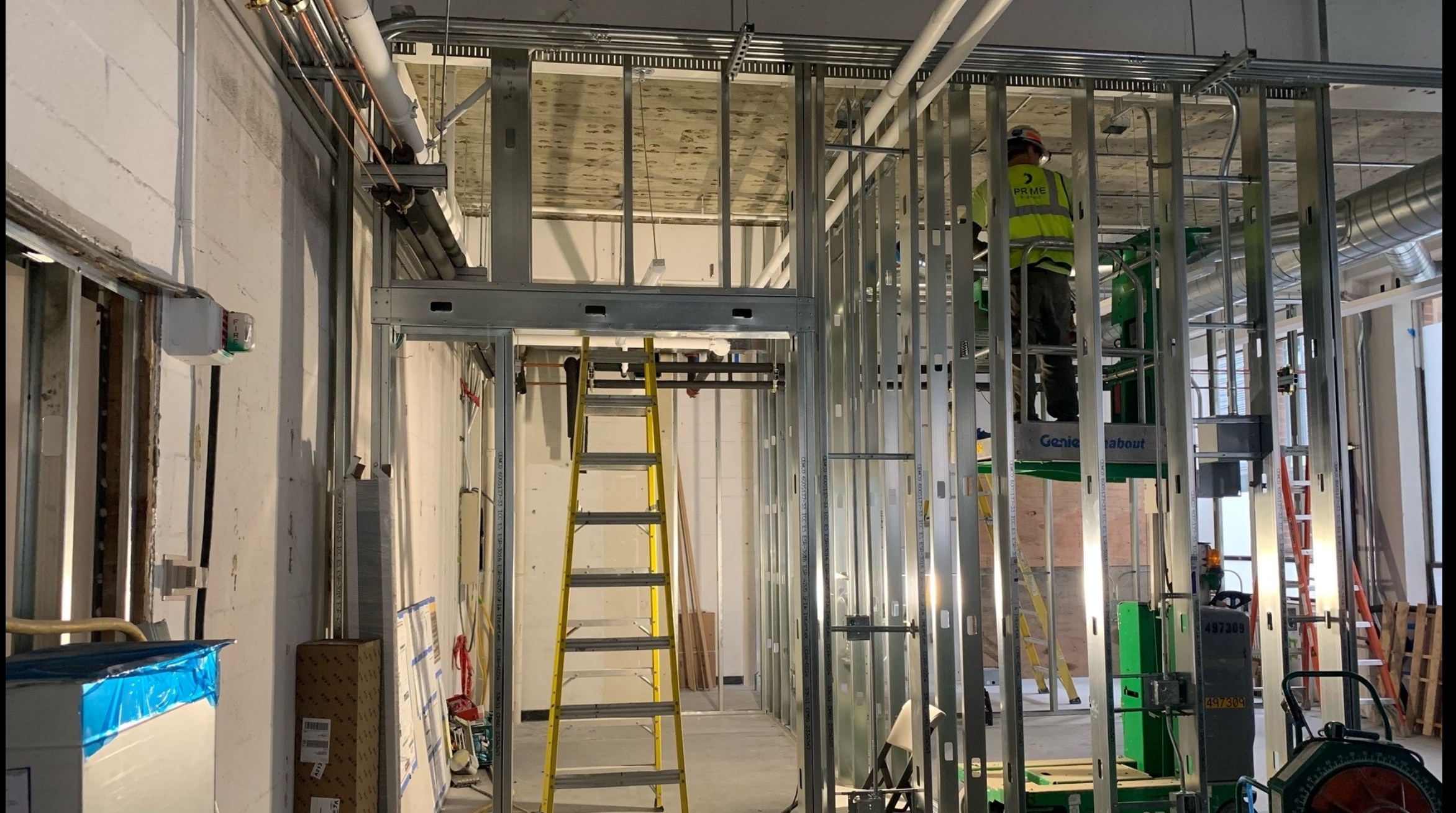
Former Jacob Lawrence Gallery space; framing for storage & kiln room adjacent to ceramics classroom