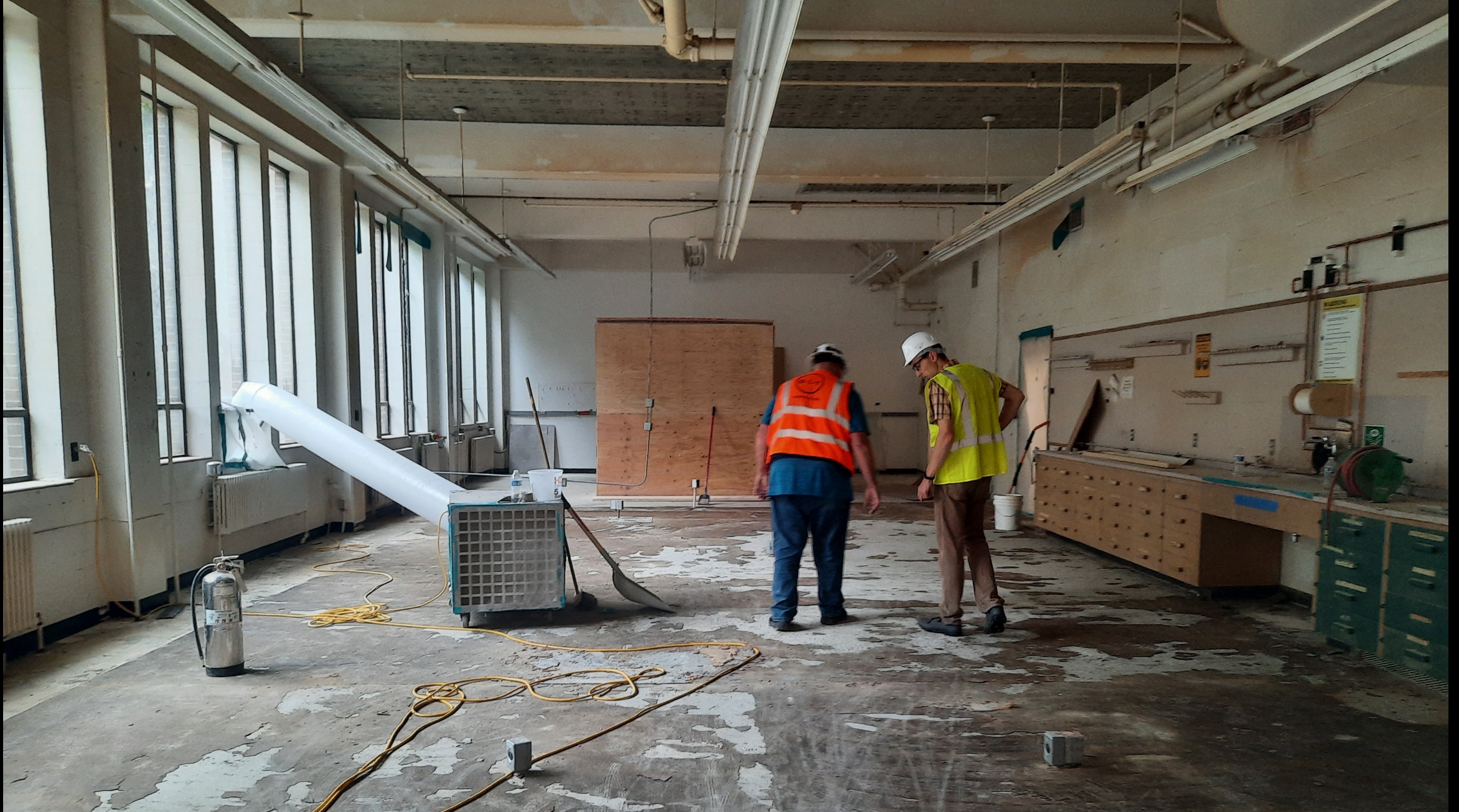
Woodshop space after demolition