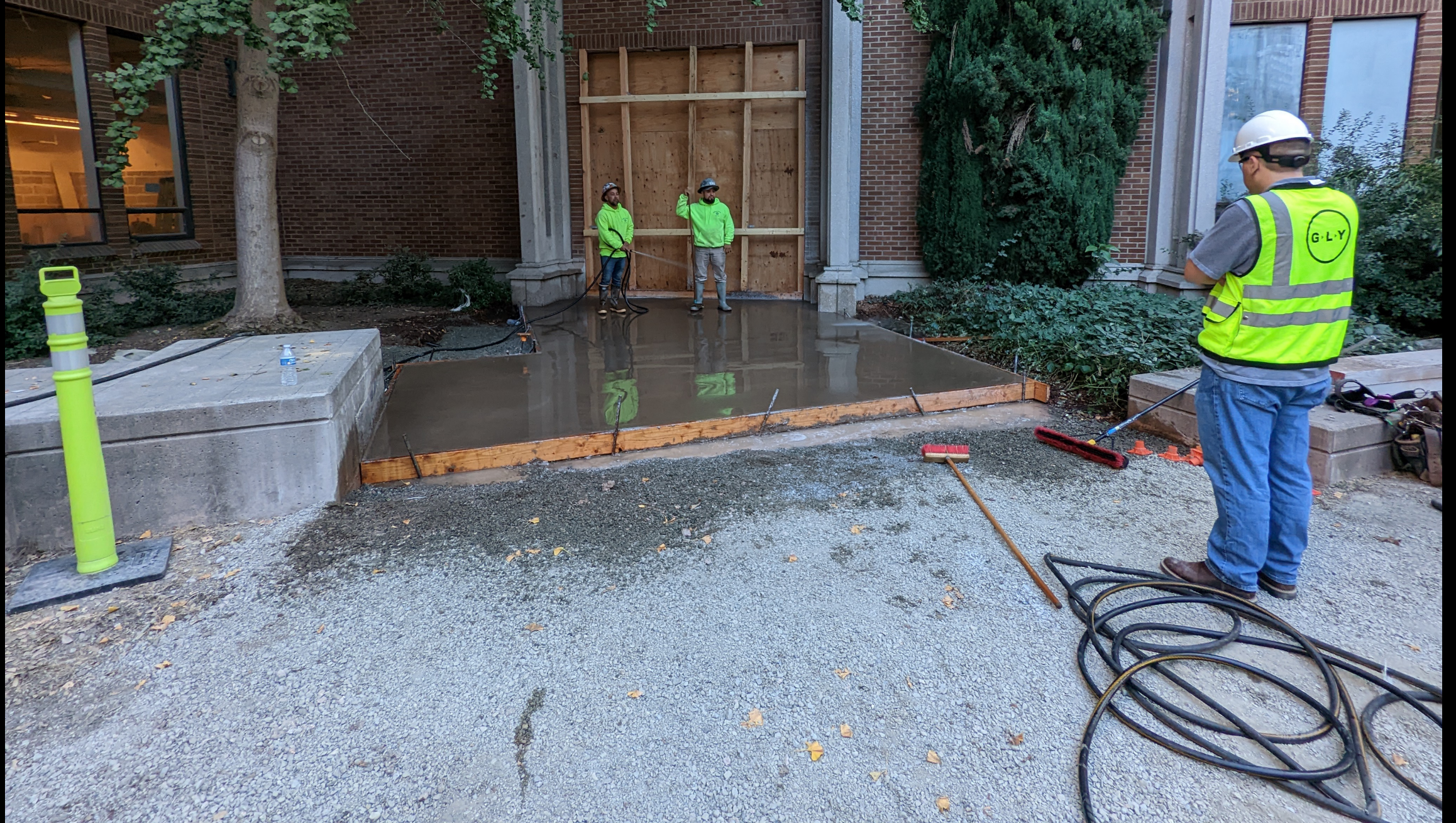
Preparation of new building entrance between Jacob Lawrence Gallery and courtyard