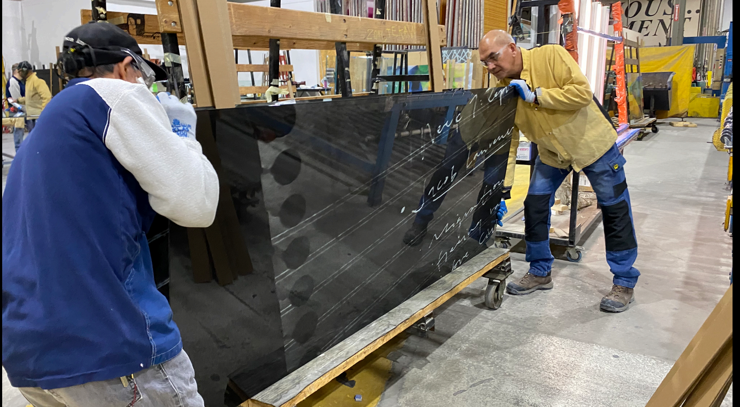
Fritted glass for the new Jacob Lawrence Gallery windows