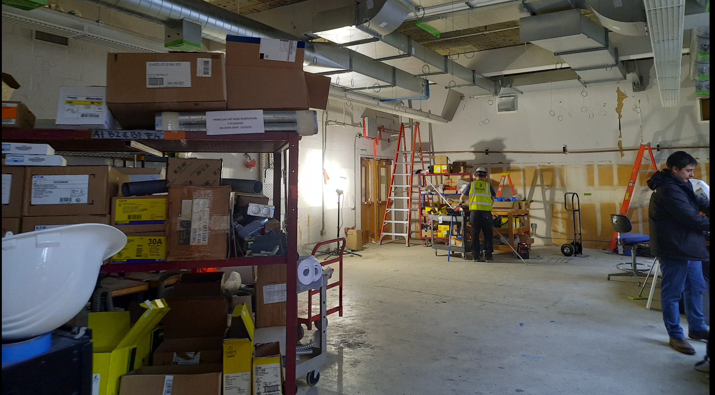
Former ceramics classroom; will be glass classroom