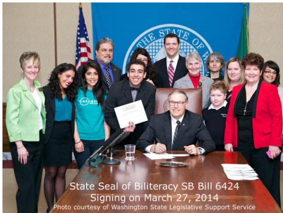
State Seal of Biliteracy SB Bill 6424 Signing on March 27, 2014