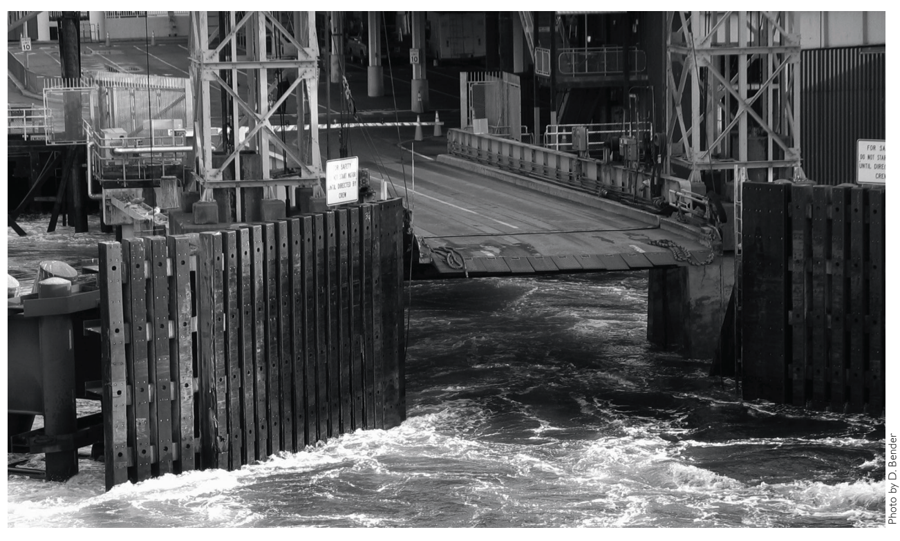
Current timber elements in ferry terminal wing walls could be replaced with composite material components.