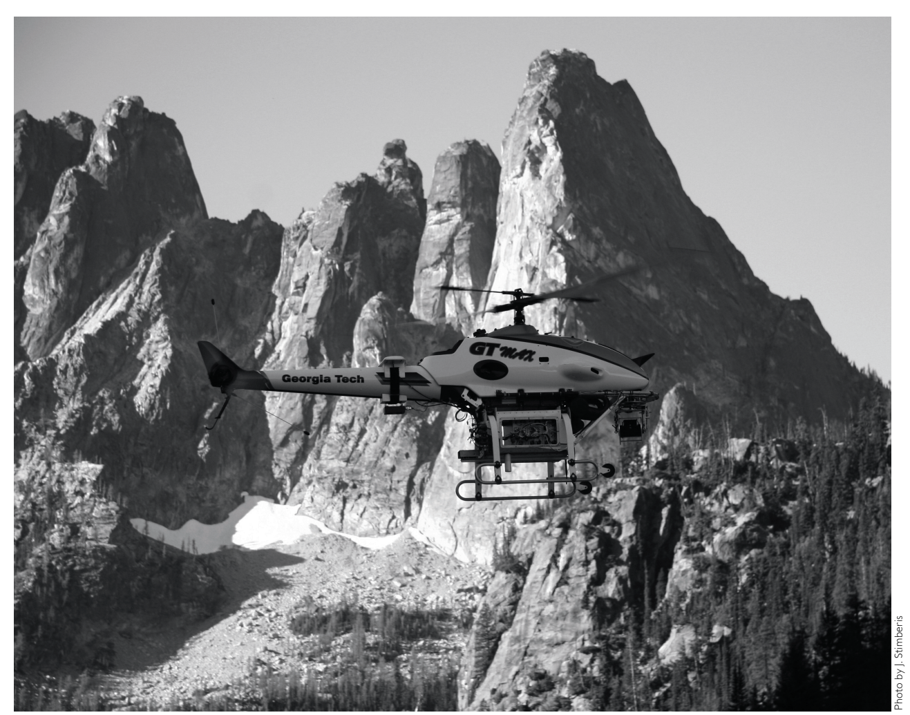
Unmanned aerial vehicles are becoming small and inexpensive enough that WSDOT is investigating their potential use for avalanche control and search and rescue operations.