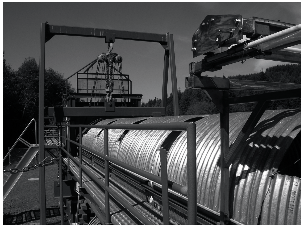
Different culvert configurations and associated hydraulic conditions are being tested for their effects on salmon passage.