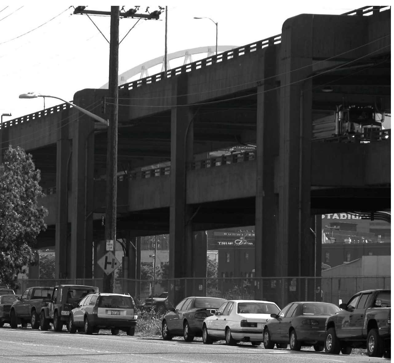
Soil liquefaction during an earthquake may damage existing structures, such as the Alaskan Way Viaduct in downtown Seattle. Researchers are studying ways to better evaluate liquefaction hazards.