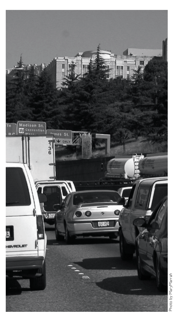
Numerous projects are looking at different ways to better measure and predict congestion.