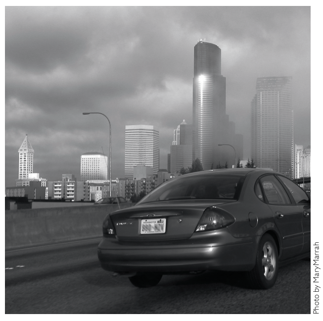
Researchers developed an algorithm to use rainfall radar measurements in predicting traffic speed reduction.

While it is often asserted that there is a causal relationship between weather and roadway delays, this relationship has not been quantified. This project sought to find ways to correlate the effects of weather with both non-recurring traffic congestion and conditions that may increase incidents or accidents. Data from two databases maintained at the University of Washington were combined to evaluate the quantitative relationship between freeway speed reduction (as measured by freeway inductance loops) and rainfall rate (as measured by Doppler radar). An algorithm was developed to use rainfall radar measurements in predicting traffic speed reduction. This research has the potential to enable transportation professionals to (1) predict non-recurring traffic congestion caused by weather and (2) predict conditions