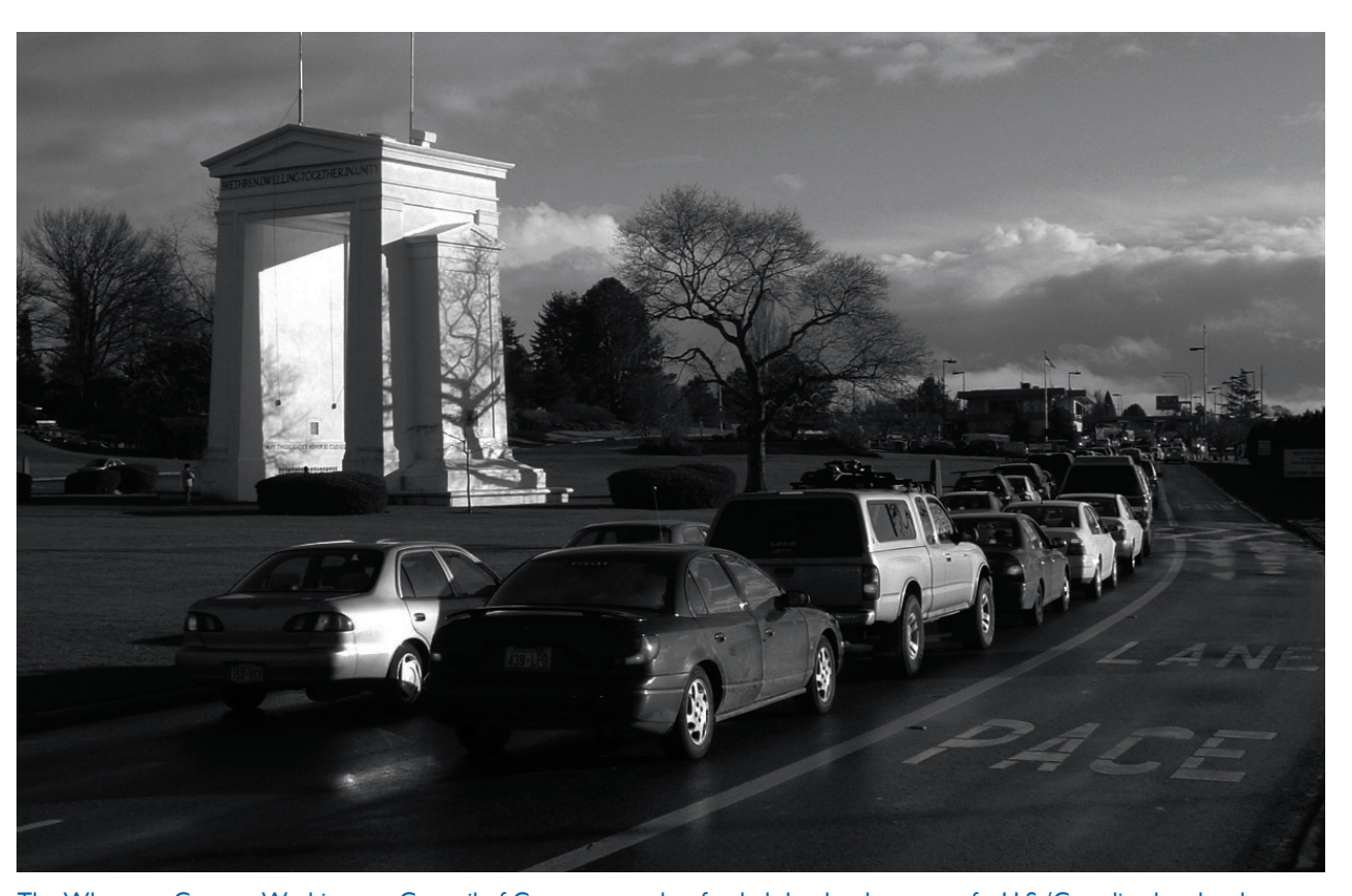
The Whatcom County, Washington, Council of Governments has funded the development of a U.S./Canadian border data management system for the Peace Arch and Pacific Highway border crossings to provide the public with an online query tool and border crossing information.

The U.S. Department of Transportation's Joint Program Office (JPO) is charged with collecting information about public agency experiences with state and local intelligent transportation system (ITS) projects. One of its databases is the ITS Lessons Learned Resource, designed to provide better access to information about stakeholder experiences with ITS planning, deployment, operations, and maintenance. Because WSDOT had completed 13 ITS projects that included detailed evaluations, the JPO asked WSDOT and TRAC to test and proof its database information entry template by provid-