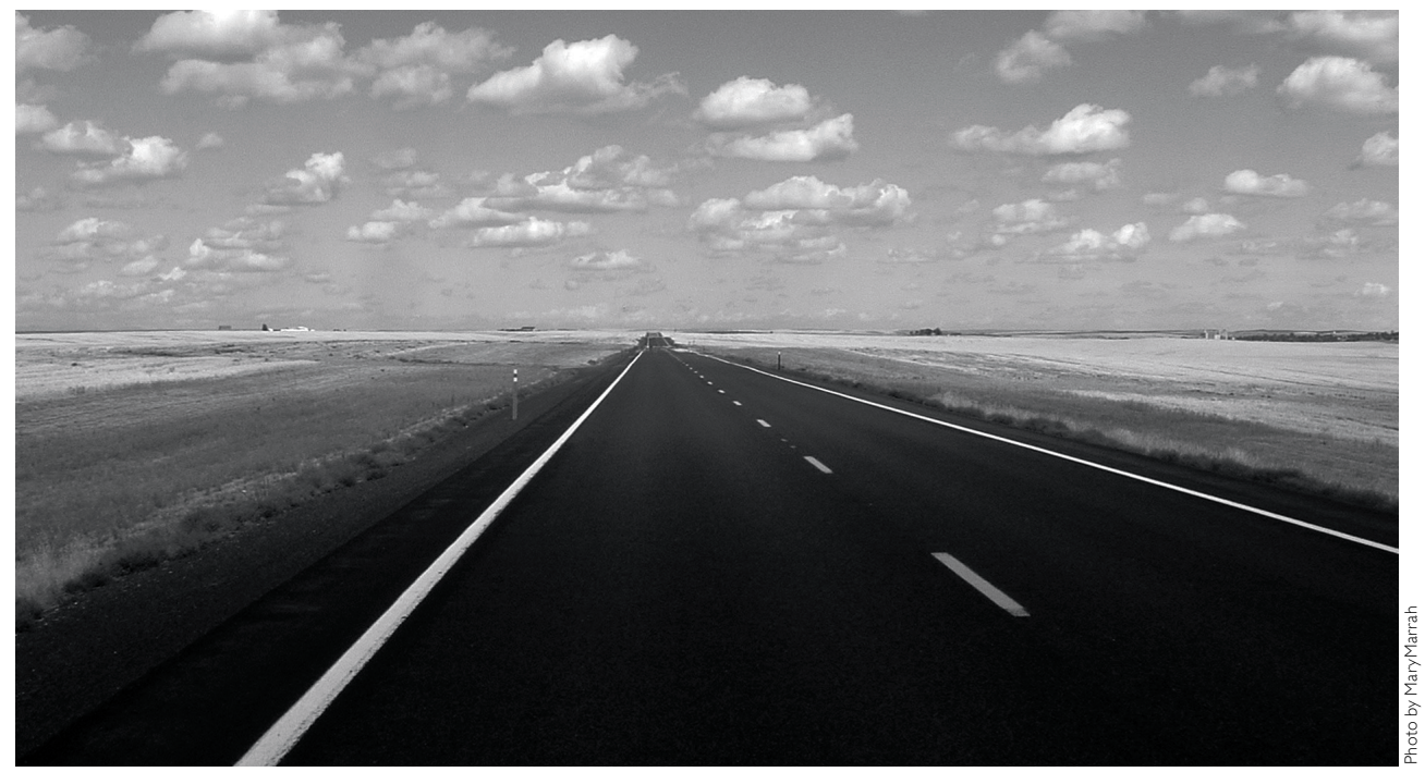
The Washington State Pavement Management System, which helps engineers examine and evaluate state roadways, was enhanced to group roadway segments together for better overall analysis and management.

Sponsors: Fugro-Bre/Montana Department of Transportation