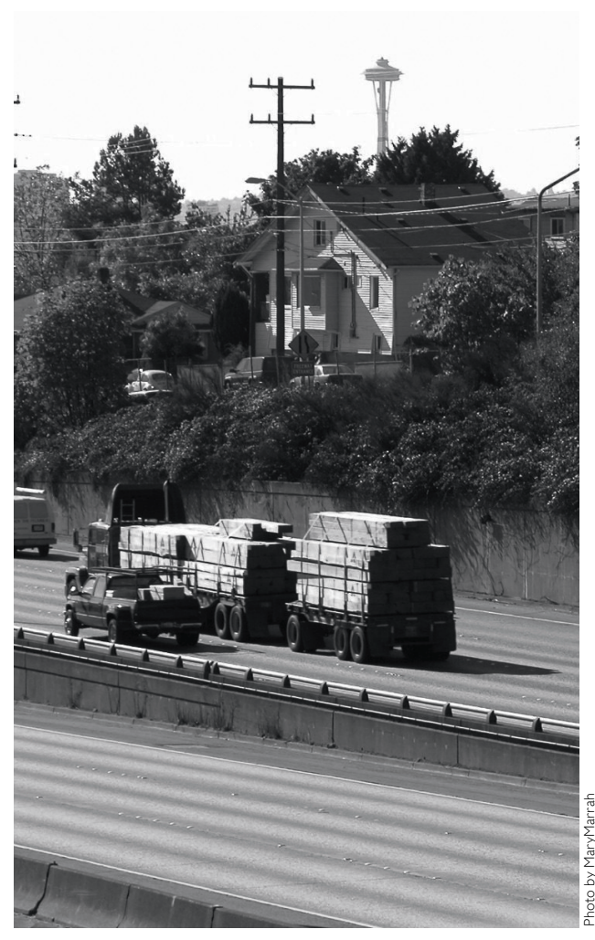
By combining information about the future of Washington forests with data on roadways and transload facilities, researchers will produce estimates of current and future use of the state's roadways by the forest products sector.

regional level, while applying more multimodal transportation system measures at the local level.