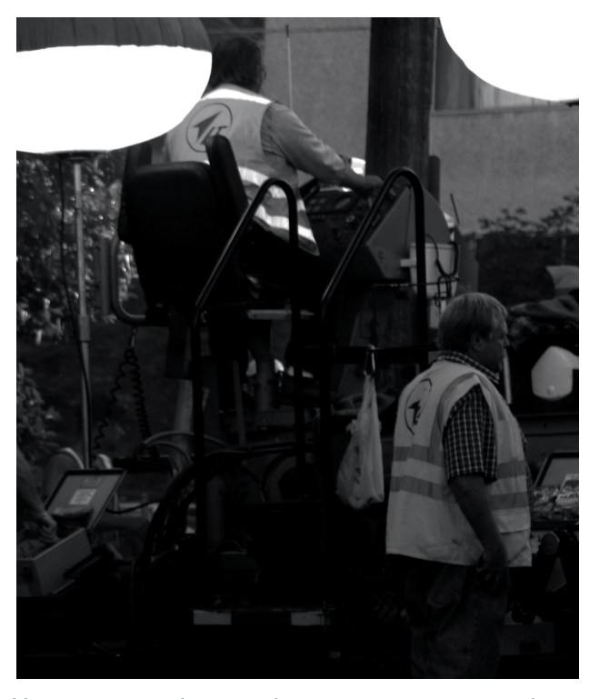
Maintenance at night may make operations more cost and time effective.

Research to improve project scoping, budgeting, and management is critical for improving the success of and accountability for the hundreds of major transportation projects that are constructed every year. Project scope, time, and cost estimates for these projects are critical in making decisions about planning, monitoring, and budgeting and for maintaining accurate accountability to the taxpayers for effective project delivery.