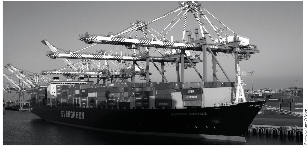
Electronic seals for cargo container doors are being tested for their ability to increase security and track container movements.