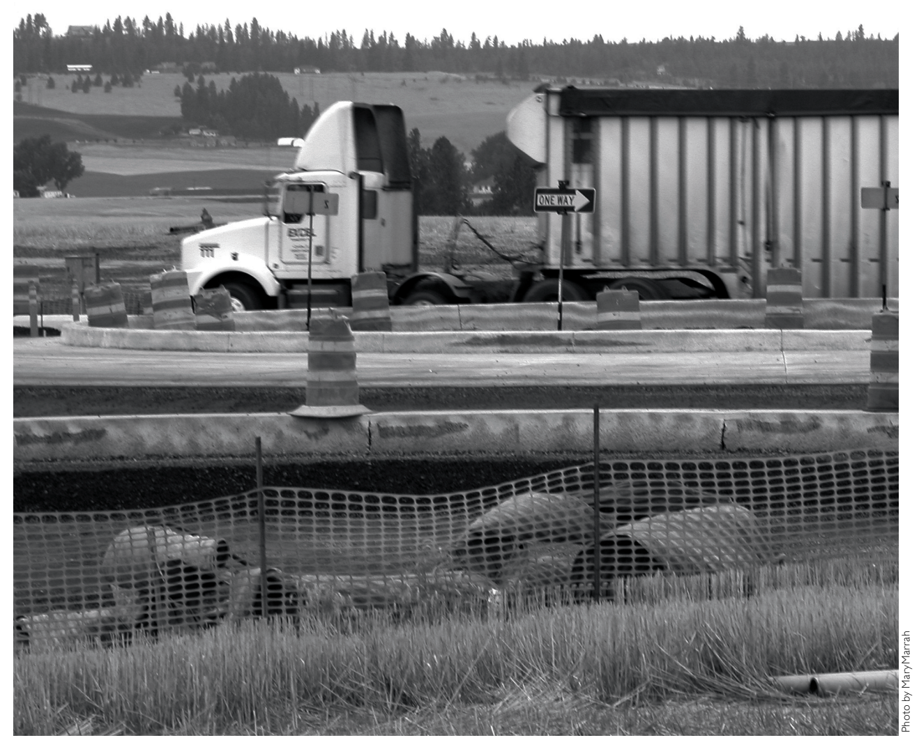
Researchers developed tools to improve predicted time and costs for highway projects, such as this round-about construction near Spokane, Washington.