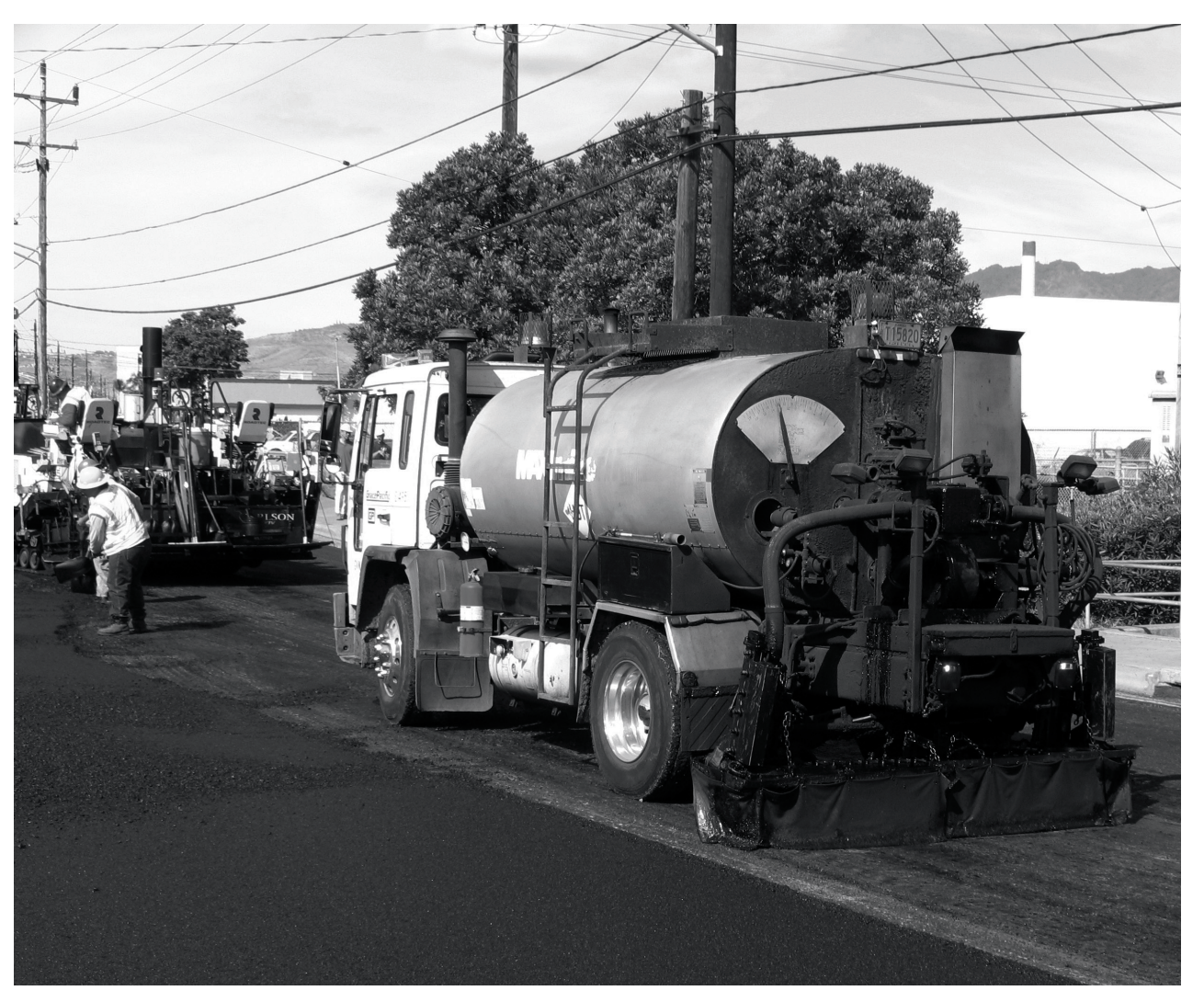
Researchers investigated the influence of several factors on the adhesive bond provided by a tack coat at the interface between pavement layers.

A bituminous surface treatment (BST), often referred to as a chip seal or seal coat, is a thin surface treatment of liquid asphalt covered with an aggregate that has an applied thickness of about 0.5 inch or less. BSTs are normally applied to pavements with lower traffic volumes, but it is possible to successfully apply a BST on high speed, high traffic roads when precautions are taken. This study used the Highway Development and Management System (HDM-4) software to test the average annual daily traffic and equivalent single axle load levels appropriate as criteria for selecting the application of BSTs to WSDOT pavements. It verified the feasibility of using BSTs to maintain pavements with higher traffic levels. The study also determined the validity of alternating the application of BST resurfacings and 45-mm HMA overlays. In addition, it estimated the impacts that increased use