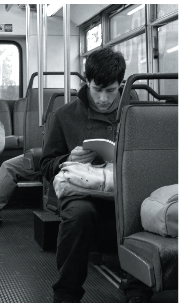
The successful MyBus and BusView real-time transit information systems developed as TRAC research projects have been transferred to King County Metro for operation and maintenance.

The Phase I ATIS Evaluation Framework project developed a standard evaluation method that is applicable to a range of advanced traveler information system (ATIS) projects. The primary purpose of an evaluation is to give planners an understanding of intelligent transportation system (ITS) deployments during various project stages. The framework focuses on quantifying the benefits and costs of ITS projects by looking at technical and institutional issues that arise; the measures or strategies taken by project partners to address and resolve those issues; and lessons learned that might be applicable to future ITS deployments. Since the Phase I project,