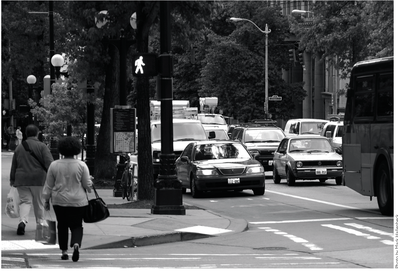
Systems developed to monitor freeways are being modified to also monitor arterial performance in order to improve traveler information, roadway operations, and planning.

To improve the performance of the state's roadway system, WSDOT needs to have accurate measures of roadway system performance. To meet that need, the Department requires a robust and flexible system that collects, stores, summarizes, and makes available roadway data. A number of efforts are already under way within the WSDOT to collect, archive, and distribute data. However, the Department has lacked guidance on how to gather the data it is collecting so that they may be combined with other WSDOT data sets, and make the combined data available in a useful manner. The primary objective of this research effort is to recommend costeffective ways to make existing WSDOT data sources more readily available. The intent is to allow previously collected data to be easily located by users throughout WSDOT, who can then quickly understand, obtain, and integrate them with data from other sources. When the archive protocol and other recommendations are implemented, they should reduce the cost of archive development, decrease the number of data that must be