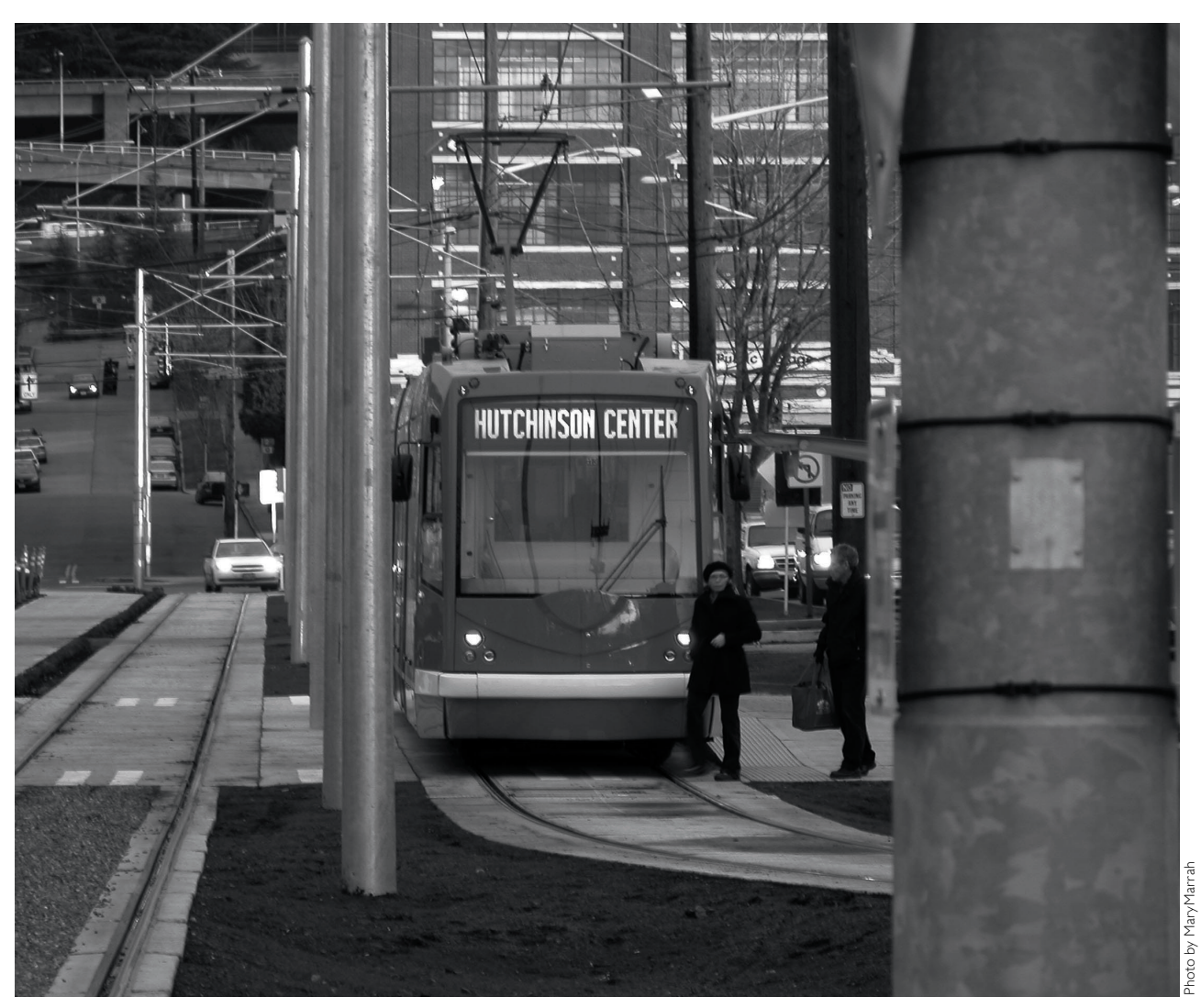
In preparation for studying expansion of Seattle's streetcar system, the city asked TRAC researchers to investigate ways to fund necessary capital and operating costs.

is a stronger predictor of trip chaining patterns than demographic factors; 3) a working environment conducive to walking is associated with reduced auto use for trips to and from work and increased mid-day walking trips; and 4) increased levels of mixed-use development, retail density, and street connectivity are significantly associated with lower per capita emissions and an increased tendency to walk and take transit. This information can be used by cities and counties in making land-use decisions that support lower emissions, walking, biking, and transit. Principal Investigators: Frank, L., Lawrence Frank and Company, Inc./ Bradley, M./Lawton, K., Keith Lawton and Associates