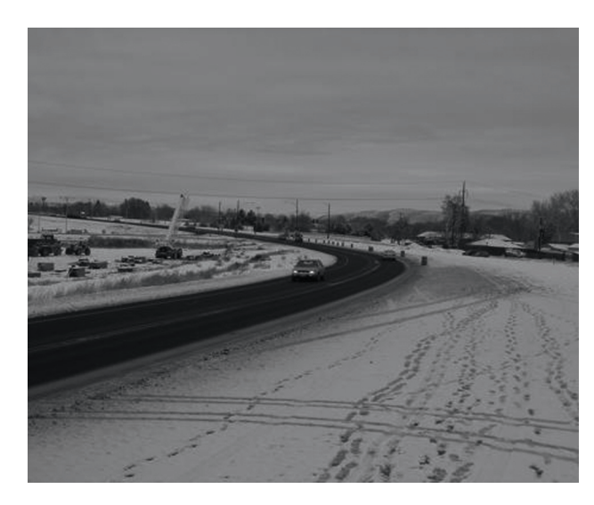
A database of Yakima County roads was incorporated into WSDOT's Automated Real-time Road Weather System to provide county-specific forecasts to highway maintenance personnel.