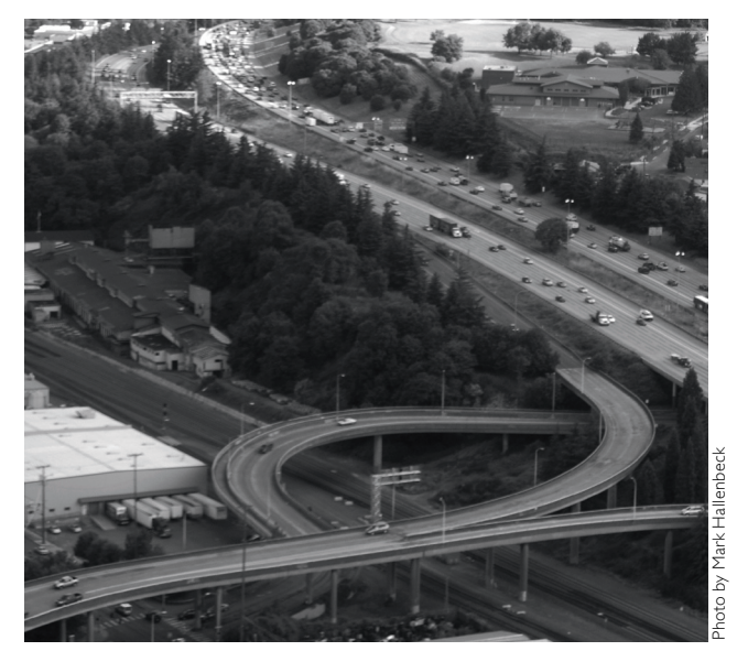
Research seeks to reduce congestion on and coordinate traffic between both freeways and arterials.

For years Washington has worked to manage highway congestion with tools such as high-occupancy vehicle (HOV) lanes; metered on-ramps; variable-direction express lanes; traffic cameras, variable message signs and traffic management centers; Incident Response Teams; and signal