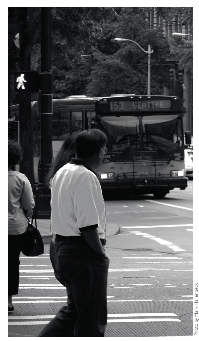
HOV lanes are considered important components of traffic management on both freeways and arterials.

data without having to install costly dual-loop systems.