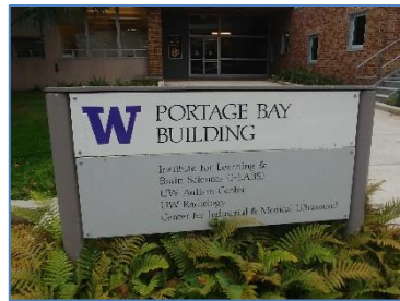
Sign of PB Building