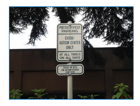
UWAC Pre-Paid Parking Signs

Seattle Office Box 357920 Seattle, WA 98195-7920 206.221.6806 fax 877.719.8701