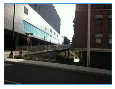
Main Entrance to IHDD

Please check in at the reception desk. If you are late, can't find your way, or your clinician has not met you, please call your Patient Navigator or person you are visiting.