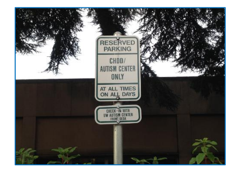
UWAC Pre-Paid Parking Signs