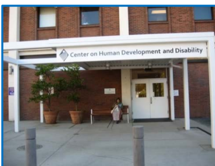
Ground Floor Entrance