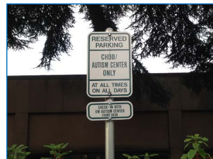
UWAC Pre-Paid Parking Signs