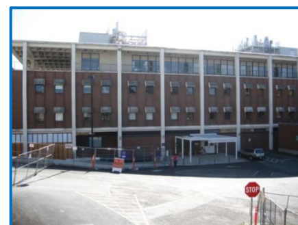
IHDD from S1 Parking Lot

Please check in at the reception desk. If you are late, can't find your way, or your clinician has not met you, please call your Patient Navigator or person you are visiting.