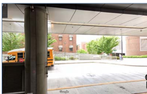
Loading Lane/Zone in Front of Main Entrance Ramp