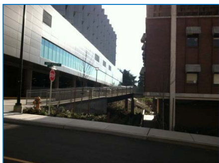
Main Entrance to IHDD

The IHDD is a 4-story brick building just east of the S1 parking lot. There are two entrances. Please do not park in front of the Ground Floor Entrance. Please pull into the loading lane in front of the Main Entrance. The main entrance facing the UW Medical Center leads you up a ramp and directly into the reception area.