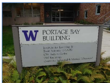
Sign of PB Building