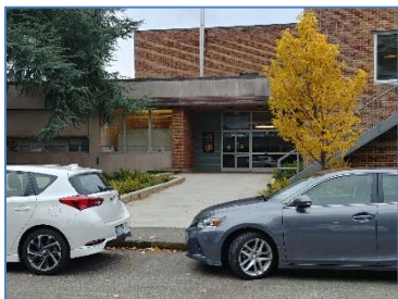
PB Building from S1 Parking

The Portage Bay (PB) Building is a red brick (two ends) and gray (center) building just south of the S1 parking lot. The UWAC is located on the west wing of the building. If you are facing south, towards the lake and away from the UW Medical Center, the UWAC is on the right end of the building.