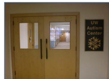
Entrance to UWAC

Please check in at the reception desk. If you are late, can't find your way, or your clinician has not met you, please call your Patient Navigator or person you are visiting.