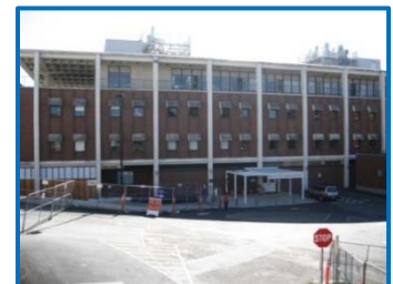
IHDD from S1 Parking Lot