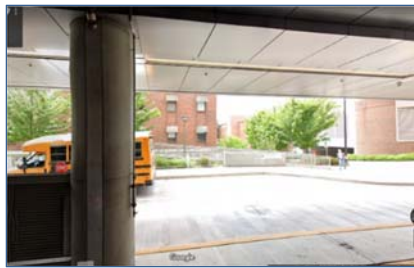
Loading Lane/Zone in Front of Main Entrance Ramp