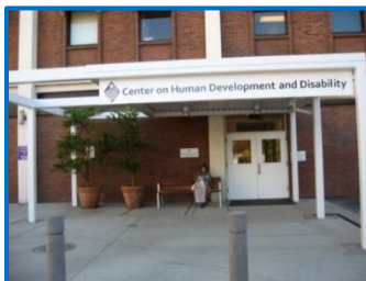
Ground Floor Entrance