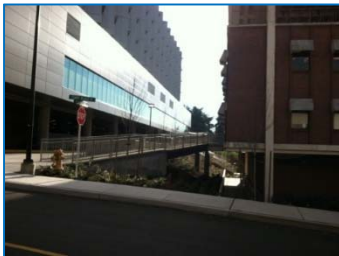
Main Entrance to IHDD

The IHDD is a 4-story brick building just east of the S1 parking lot. There are two entrances. Please do not park in front of the Ground Floor Entrance. Please pull into the loading lane in front of the Main Entrance. The main entrance facing the UW Medical Center leads you up a ramp and directly into the reception area.