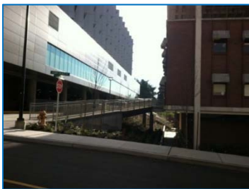
Main Entrance to IHDD

Please check in at the reception desk. If you are late, can't find your way, or your clinician has not met you, please call your Patient Navigator or person you are visiting.