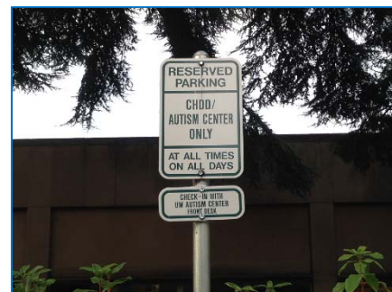
UWAC Pre-Paid Parking Signs