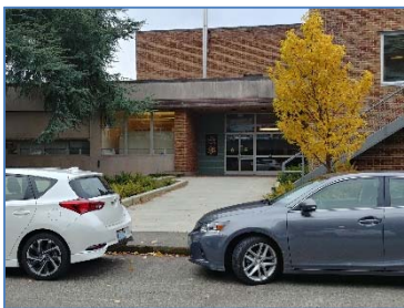
PB Building from S1 Parking

The Portage Bay (PB) Building is a red brick (two ends) and gray (center) building just south of the S1 parking lot. The UWAC is located on the west wing of the building. If you are facing south, towards the lake and away from the UW Medical Center, the UWAC is on the right end of the building.