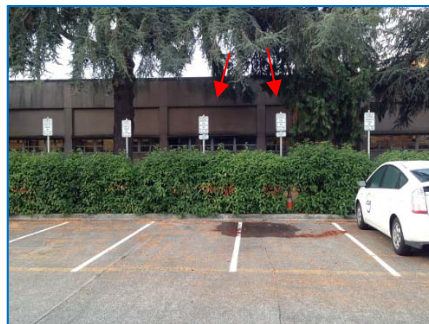
UWAC Pre-Paid Parking Spaces Picture 2