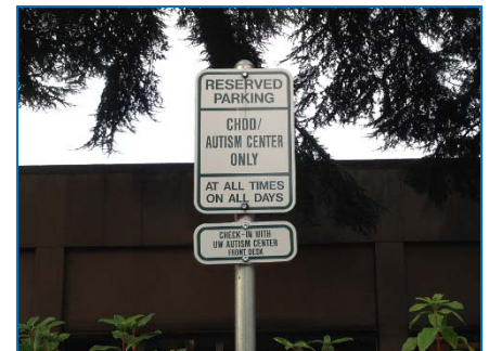
UWAC Pre-Paid Parking Signs