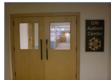
Entrance to UWAC