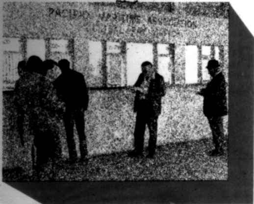
Wages and Hours

In another caucus action, delegates reaffirmed the proposal of the International Executive Board for an all-out-campaign to free Teamster president Jimmy Hoffa from prison.