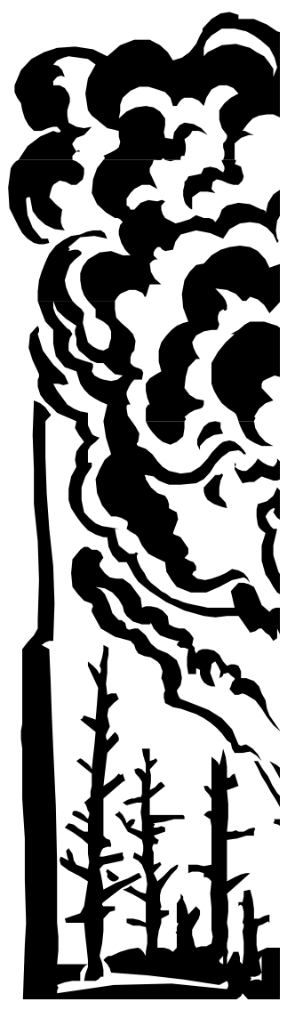
smoldering stages of a fire.

Smoke events often catch us off-guard. This guide is intended to provide local public health officials with the information they need when wildfire smoke is present so they can adequately communicate health risks and precautions to the public. It is the product of a collaborative effort by scientists, air quality specialists and public health professionals from Federal, state and local agencies.